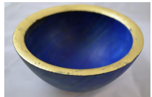
Roper – Sycamore, Transtint Dye, Gold Leaf