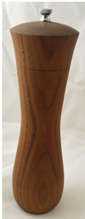
Roper – Walnut