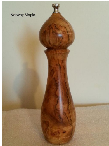
Pat Scott – Norway Maple