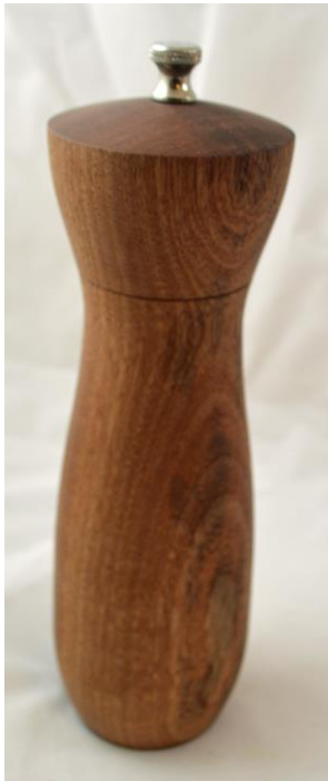
Roper – Sandos Mahogany