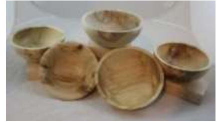
Empty Bowl Project Reminder for November.