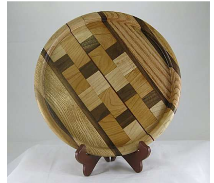
Scott Hussey – Small Cheese Platter out of Cherry, Maple, Walnut, and Oak w/Antique Oil finish. Interior wood from wood raffle. Oak is from 100 year old school in Iowa.