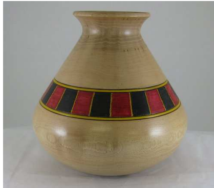
Phil Houck – Hollow form out of Hickory.