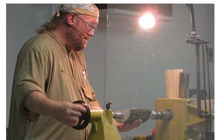
Using the tailstock to advance the wood into the drill bit.