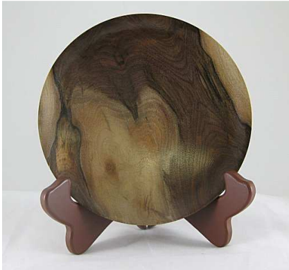
Bob Carver – Walnut platter w/Arm-R-Seal finish.