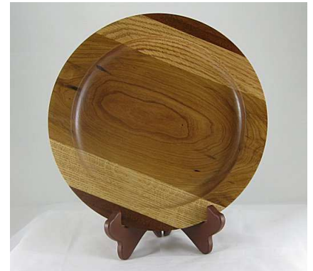
Scott Hussey – Small Platter out of Cherry, Oak, and Mahogany w/BLO and Wipe on Poly finish.