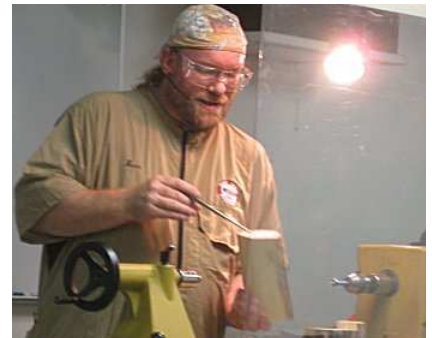
Bear, discussing center point location prior to drilling.