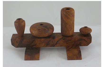
Roper – "Family Portrait" out of Burmese Rosewood Burl w/Wipe-on Poly finish. Tallest piece is 2". For sale, contact Roper.