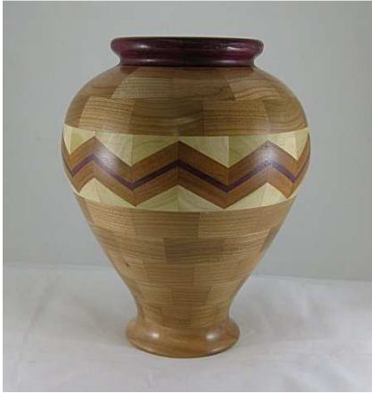
Walt Kelm – Segmented Vase out of Cherry, Mahogany, Purple Heart, and Poplar w/Beal buff finish.