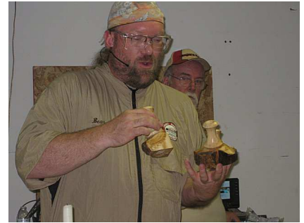
The concept discussed.

bottom detail. Give definition to transition areas. Thanks Bear!