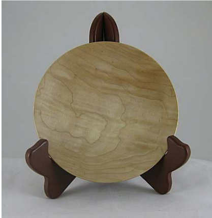
Bob Carver – Maple platter w/ Gel Top Coat finish.