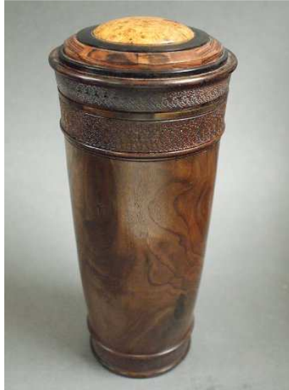
Pat Hannon – Lidded vessel, textured, inlaid, w/ segmented ring.