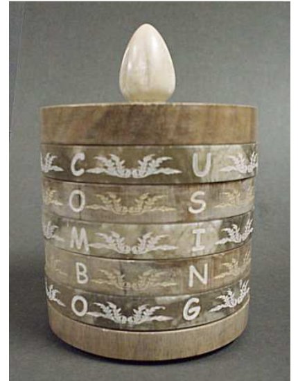
Paul Stafford – Alabaster and walnut cryptex.