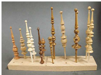
Curt Vogt – Assorted collection of finials.