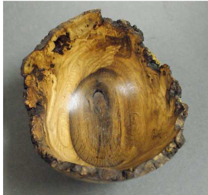
Mike Zipparo – Gambel Oak natural edge bowl w/ tung oil finish.