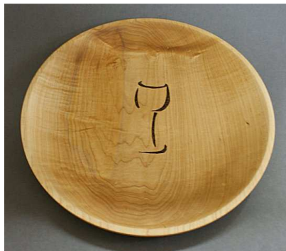
Curt Will – Hard Maple w/ Walnut Oil finish.