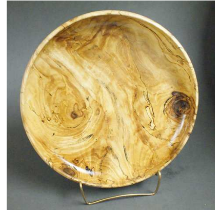
Gruelt Baker – Spalted Maple platter w/ lacquer finish.