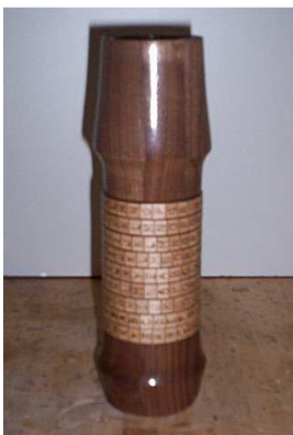
Ken Miller – 'DaVinci Flash Light' Cryptex out of Walnut w/ segmented Maple and Walnut rings, spray lacquer finish. Winner of the intermediate/advanced turning challenge.