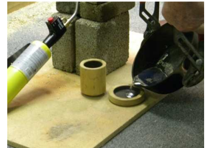
Casting Pewter molds.