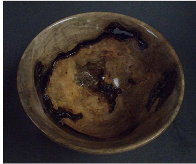
Brian Boase – Silver Maple Burl bowl w/ lacquer finish.