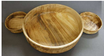
Terence Rice – Salad bowl set out of Cottonwood w/ tung oil finish.