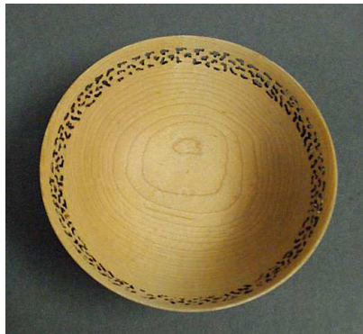
Curt Will – Hard Maple w/ Walnut Oil finish.