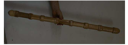
Fred Muzechenko – Fly rod tube of Oak w/ sanding sealer and Waterlox finish.