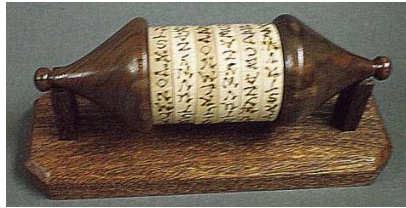
Paul Russell – Walnut and Maple Cryptex w/ tung oil finish.