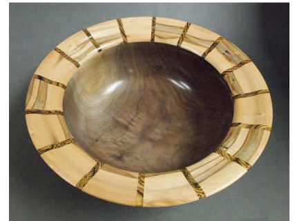
Jeff Turner – Walnut, Ambrosia Cherry, and Bacote w/ beall buff finish.