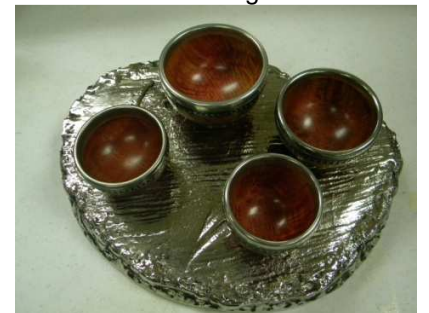
Pewter edged bowls.