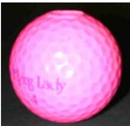
Closeup of a hollowed golf ball.