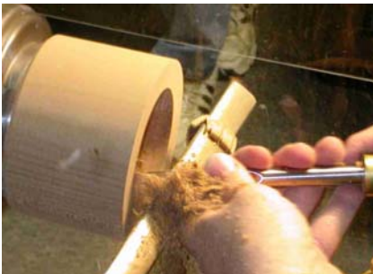
Cleaning up the sides.