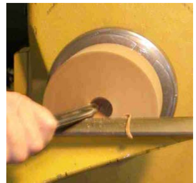
Notice how he moves from the center to the outside rim, to follow the grain.