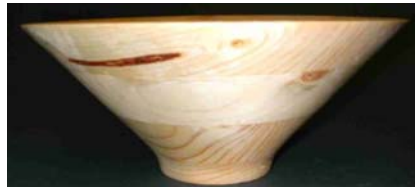
Greg Kline – Stacked ring bowl of pine.