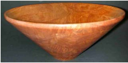
Tom Tedesco – Stacked ring bowl of birch.