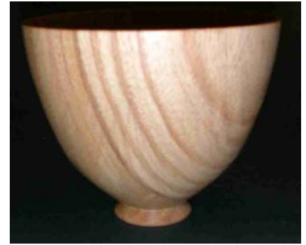
Pete Holtus – End-grain bowl of elm.