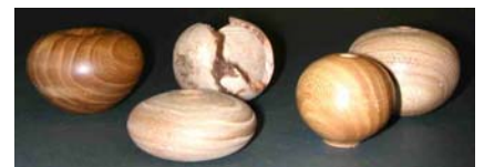
Bruce Perry – Miniature hollow forms of various woods.