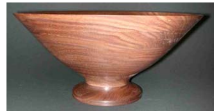
Tom Tedesco – Stacked ring bowl of walnut.