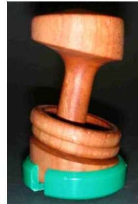
Pete Holtus – Eccentrically turned baby rattle with captured rings. Shows base jig that Pete uses to hold it in the chuck.