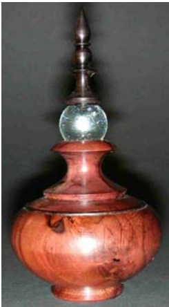
Grover Brown – Small lidded form of rosewood, ebony, glass, and holly.