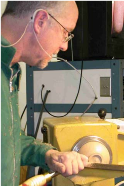
Turning the outside of the rice bowl form.