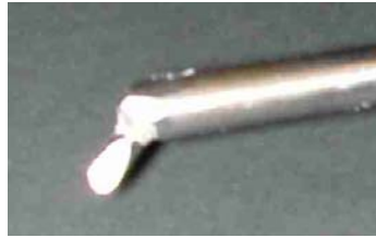
Closeup of the tool Pete uses to hollow the golf balls.