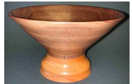
Tom Tedesco – Stacked ring bowl on pedestal of walnut and cherry.