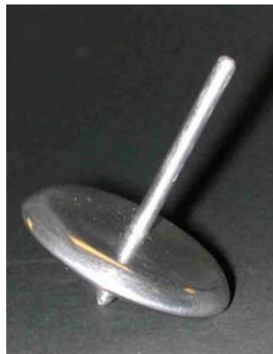
Les Stern – Very nicely balanced spinning top of aluminum.❖