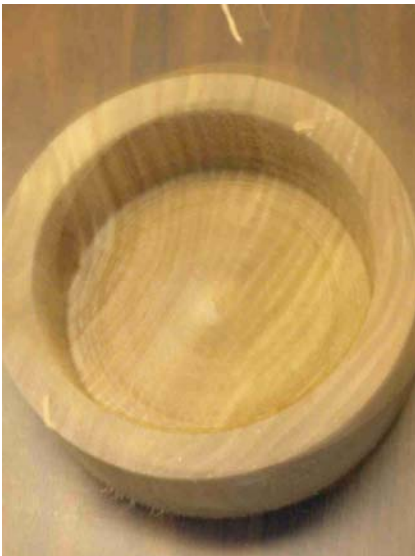
Finished hollowed end grain bowl.