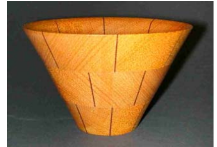
Bear Limvere – Stacked ring, segmented bowl of yellowheart and purpleheart.