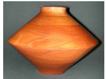
Tom Tedesco – Stacked ring hollow form.