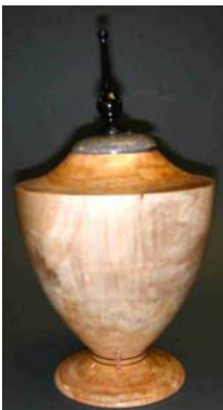
Ron Ainge – Lidded hollow form of aspen and counter material.