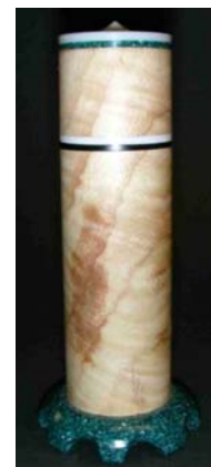
Gene Wentworth – Box with threaded lid of acanthus and Corian.