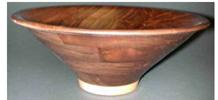
Ken Miller – Stacked ring bowl of walnut and maple.