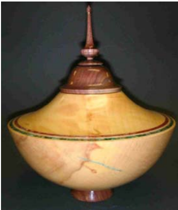
Ron Ainge – Lidded hollow form of box elder and walnut with inlaid turquoise.