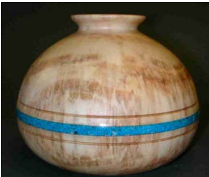
Ron Wentz – Hollow form of aspen with inlaid turquoise.