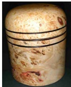
Les Stern – Lidded box of box elder burl with burned detail.