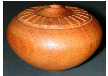
Pete Holtus – Hollow form with carved detail of mahogany.