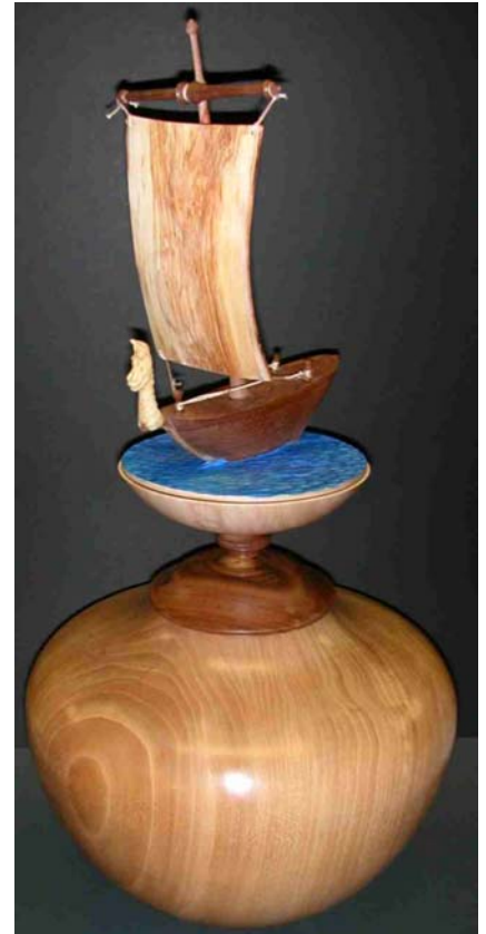
Bruce Perry – “Viking Urn” of elm and various woods. Everything is turned (including the sail!) except for the carved dragonhead.