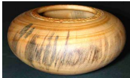
Pete Holtus – Hollow form with carved rim of Norfolk Island pine.