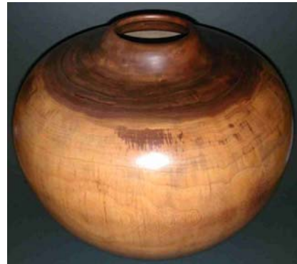
Grover Brown – Large hollow form of walnut.

The turning challenge for the October was decorative carving on a turned form. Clark won in the Beg. to Int. Category (unfortunately, we do not have a picture of the turning).