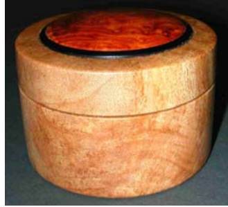
Pete Holtus – Lidded box with inlay of maple, amboyna burl, and blackwood.