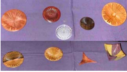
Alisa and Bear Limvere – Miniature forms featuring ornamental turning details and hand carving. Various woods and Lexan.