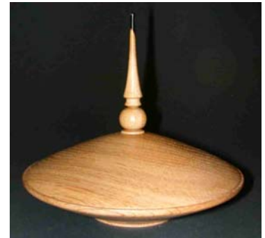
Rolla Lowery – Lidded form with finial of elm and blackwood.