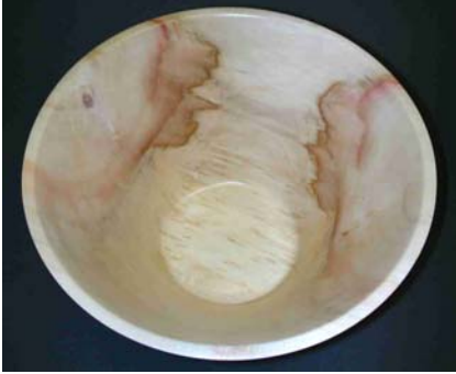
Dennis Fanning – Side and top view of bowl of box elder.