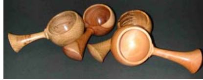
Phil Houck – Sorel-style scoops of crab apple and post oak. Winner of the Turning Challenge.