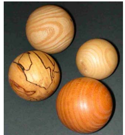
Lavonne Kaiser – Spheres of multiple woods.