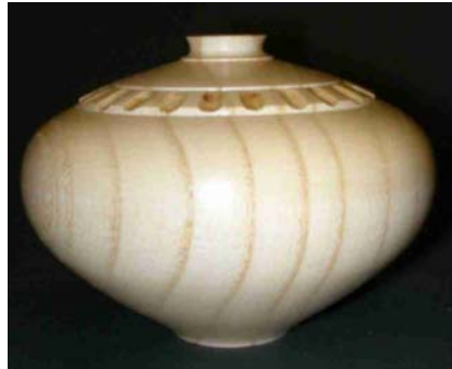
Pete Holtus – Hollow form with carved detail of ash.