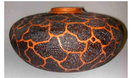
Ron Ainge – Hollow form with pyrography detail of redwood.