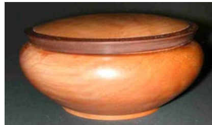
Rolla Lowery – Lidded form of quilted maple and walnut.

The turning challenge for the July meeting was Spheres or Boren-style Scoops.