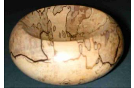
Lavonne Kaiser – Bowl of spalted maple.