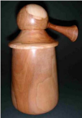
Phil Houck – Lidded canister and fitted scoop of crab apple.