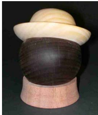
Unsigned - Sphere, hat, and stand.