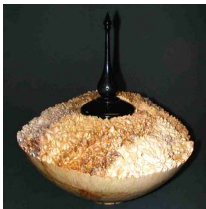
Ron Ainge – Natural-edged hollow form with ebonized finial of maple burl.