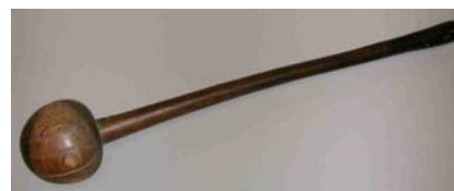
Wooden war club from Africa.