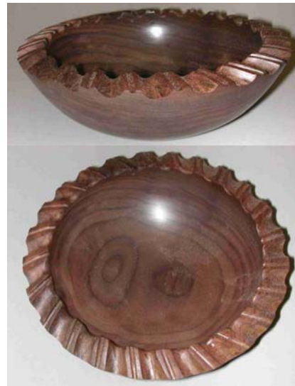
Pete Holtus – Side and top detail of carved rim, walnut bowl. Very nice!

The turning challenge for the May meeting was tool handles.