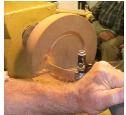
Feeding the cutter into the wood.

The system must be positioned properly so that the bit will feed into the wood just above center. The circular blade carves a hemispherical profile. You work from the center out, making cuts about 1 to 1½ inches apart. Be sure to back the blade out often to clear shavings or it will bind in the cut.