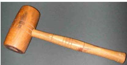
Bill Hoppers – Mallet made of apple. Used with the chisels shown below.