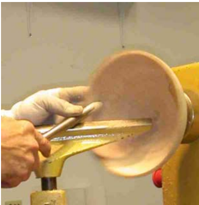
Turning the inside of one of the blanks.