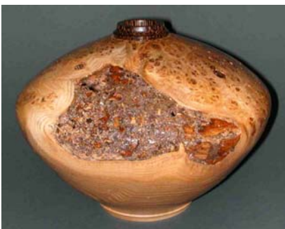
Grover Brown – Hollow form of elm burl and black palm.