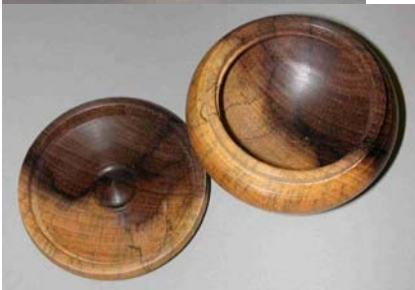
Pete Holtus – Side and top view of walnut lidded box.