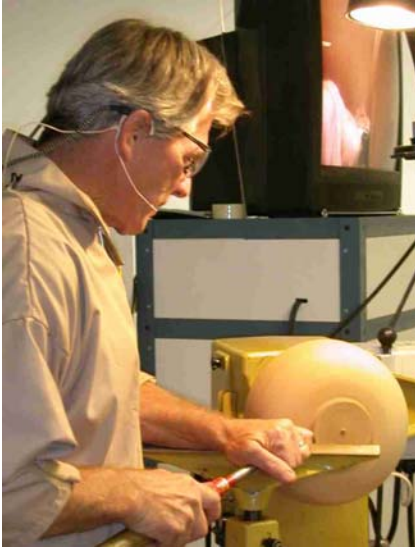
Turning the bottom of the blank.