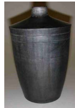
Dave Moncada – Lidded form of ebonized soft maple.