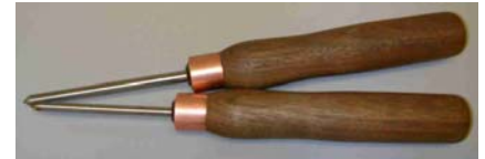
Mike Brown – Walnut tool handles.