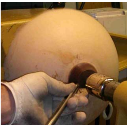
Bert attached a foot of a different wood to the bottom of the blank. ❖