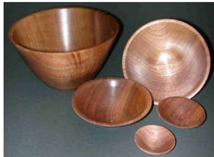
Bruce Perry – Nested set of walnut bowls made without a nesting tool set.