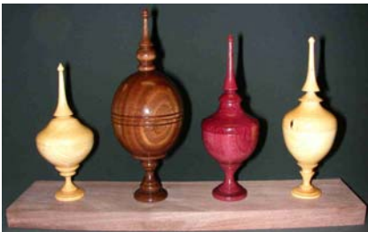
Dale Hohman – Set of lidded forms of walnut, bloodwood, cedar, and elm.