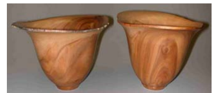
Phil Houck – Pair of natural-edged apple bowls.