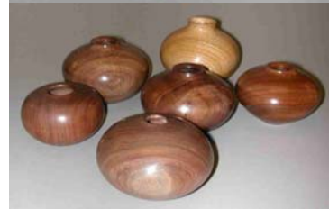
Bruce Perry - Top and side views of walnut and elm pods.