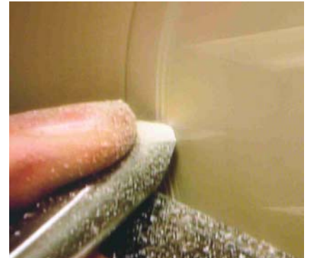
Using the point tool to add grooves for decoration. Bear keeps the face of the platter simple so that it is easy to clean, and then decorates the bottom so that it could be hung on the wall as a decoration.