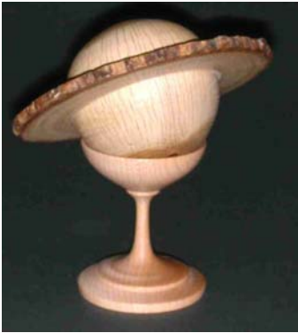
Pete Holtus – Saturn box with stand of post oak and maple.