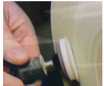
Using a friction, rotation sander to sand the bottom.