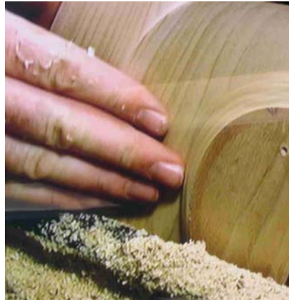
Starting to hollow the bowl. Watch the depth. ❖