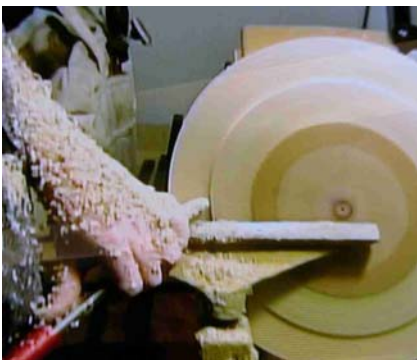
Measure the width of the rim carefully before starting the hollowing, otherwise you'll cut the rim off.