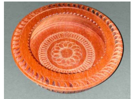
J Chick – Bowl with ornamental turning decoration, of mahogany.