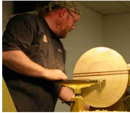
Marking the proportions of the rim to the bowl area.