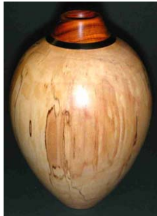
Phil Houck – Hollow form of spalted birch with cocobolo and ebony rim.