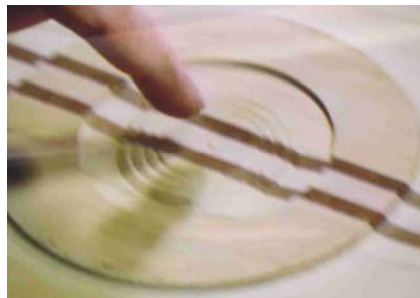
Bear will often leave the recess and decorate the center. He must make sure there is enough flat area for the chuck jaws to set properly and the center must be lower than the rest of the platter bottom (so it won't wobble).