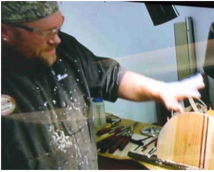
Bear has reversed the platter onto the chuck.