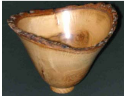
Phil Houck – Natural-edged bowl of post oak.