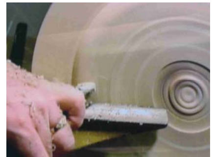
After thinning the rim, Bear is shaping the bottom profile.