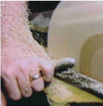
Shaping the top profile of the rim. You must thin the rim as much as desired before starting the hollow, so that there is as much support as possible. The wood will move as it is thinned, which is why Bear is using a scraping cut with the gouge.