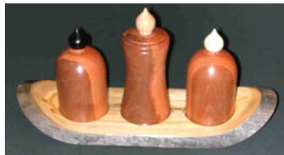
Grover Brown – Salt and pepper shaker, toothpick holder of Brazilian cherry, holly, ebony, and maple.