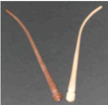
Pete Holtus – Back scratchers of maple and walnut.