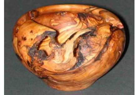
Les Stern – Bowl of Jerusalem olive.