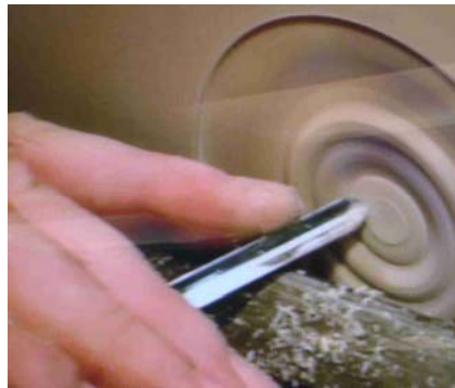
Turning bottom details in recess for the chuck.