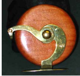
John Betts – Front and back views of fishing reel of pine, walnut, and brass.