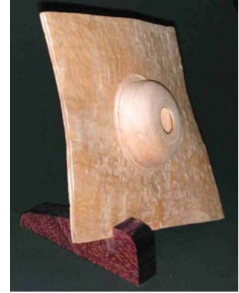
Pete Holtus – Winged hollow form with textured rim of maple. Winner of Turning Challenge, Advanced.