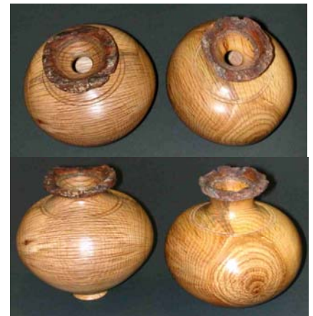
Hollow forms of post oak with natural-edged rims.