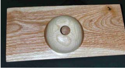
Steve Claycomb – Winged hollow form of ash.