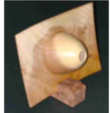
Pete Holtus – Winged hollow form of ash.