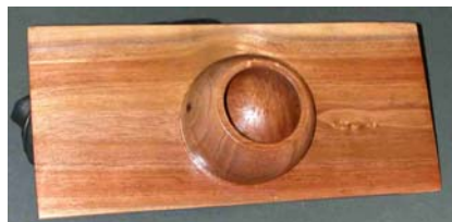
Steve Claycomb – Winged hollow form of walnut.