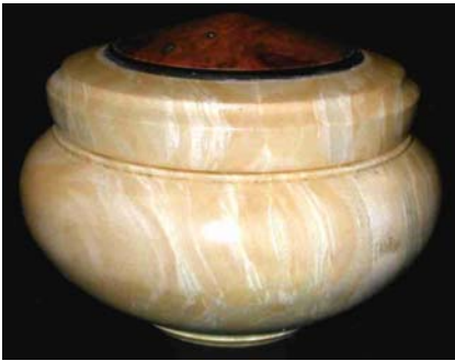
Pete Holtus – Lidded box of maple with inlaid amboyna.