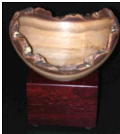
Gene Wentworth – Natural-edged bowl with stand of persimmon and rosewood.