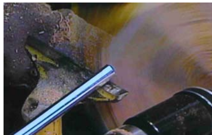
Using a blunt bevel gouge so that he can ride the bevel without have to swivel the tool too much.