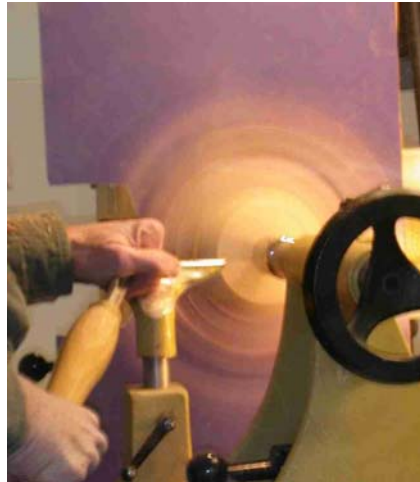
Using gouges to thin out the wings (a.k.a. "turning the ghost").