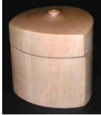
Pete Holtus – Tri-sided box of maple.