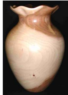
Phil Houck – Vase with carved rim of crab apple. ❖