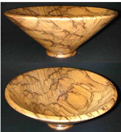
Rick Orr – Stacked ring bowl of black limba. Winner of Turning Challenge, Intermediate.