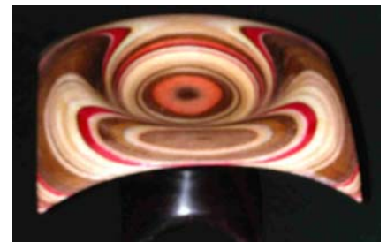
Gene Wentworth – Square-edged bowl with stand of colored wood and rosewood.