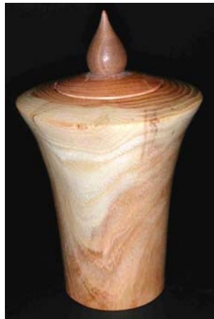
Ray Richards – Toothpick holder of locust. Uses pattern in the Feb issue of Wood Magazine.