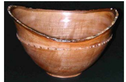
Gene Wentworth – Natural edged bowl with carved detail of apple, ebony and silver (with pretty bottom).