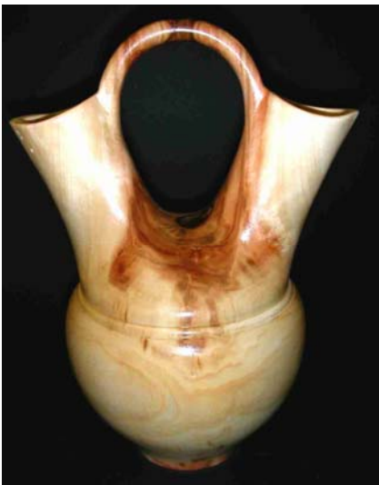
Grover Brown – Wedding vase of aspen (fully hollowed).