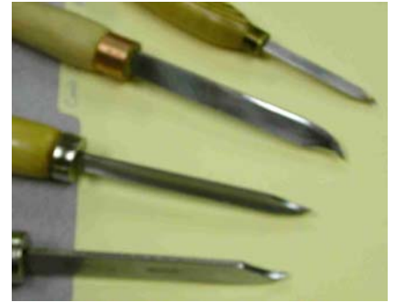
Samples of Bruce's tools, with close-ups of the bevels and curves. He's given them a reverse chamfer for use in scraping in tight corners.