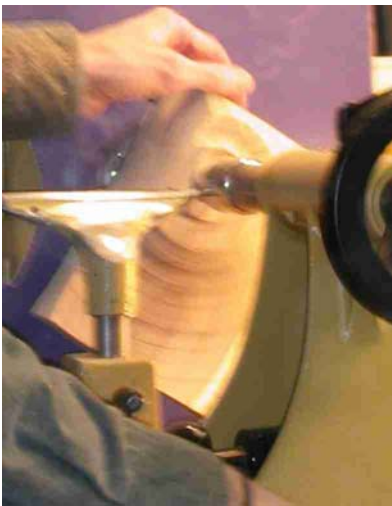
Bruce is turning the piece to make sure that it clears the tool rest. Notice how far off center it is mounted.