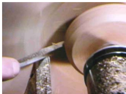
Using his special curved scrapers to turn behind the hollow form.