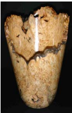
Dave Yeoman – Large, natural-edged vase of box elder burl.