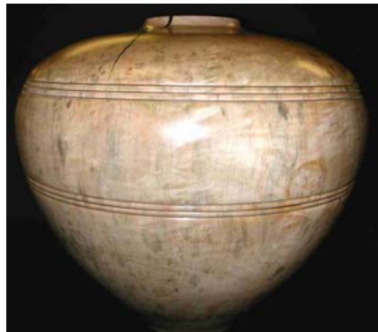
Grover Brown – Large hollow form of maple.