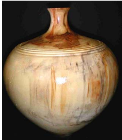
Grover Brown – Hollow form of aspen.