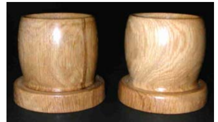
Ray Richards – Egg cups of scrub oak.