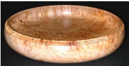
Gene Wentworth – Platter with carved rim of maple burl.