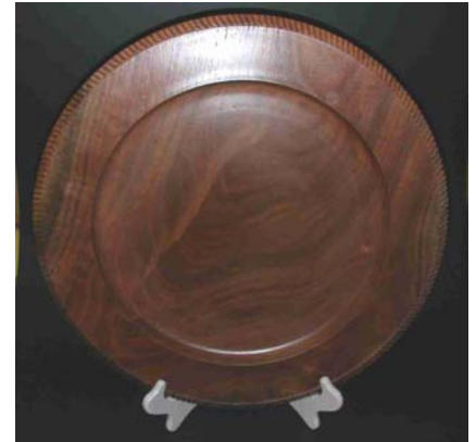
Gene Wentworth – Large platter of walnut with carved rim.