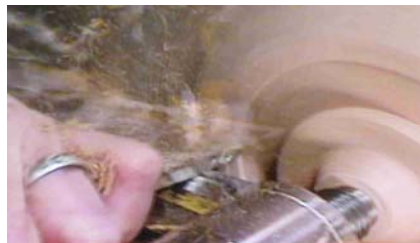
Cleaning out the wing under the hollow form.