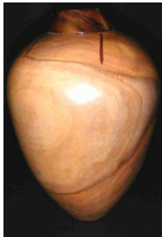
Phil Houck – Hollow form of crab apple with copper inlay.