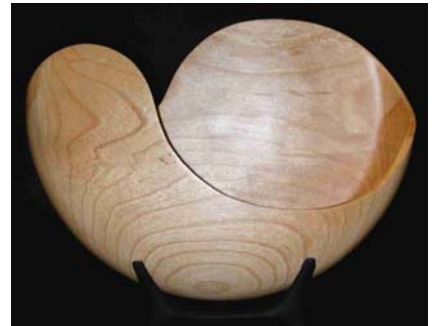
Richard Kuvila – “Shell” - carved form with stand of maple.