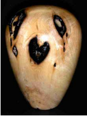
Grover Brown – Hollow vessel of persimmon.