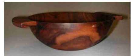
Bear Limvere – Handled drinking bowl of walnut.