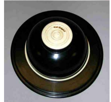
Wide-rimmed of ebony and holly. Top and bottom view. Beautiful contrast to previous piece.