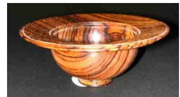
Wide-rimmed bowl of zebrano.