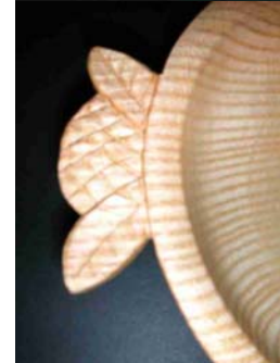
Bear Limvere – Winged vessel with carved handle of ash.