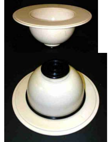
Wide-rimmed bowl of holly and ebony. Top and bottom view. Note the inlaid ring.