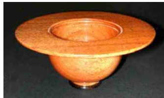
Samples of his work. Wide-rimmed bowl of anjan and ebony.