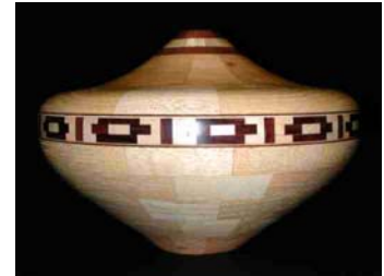
Jim Gennack – Segmented hollow form of maple, walnut, and oak.