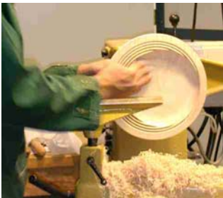
Bowl has been remounted to an eccentric axis and hollowed.❖