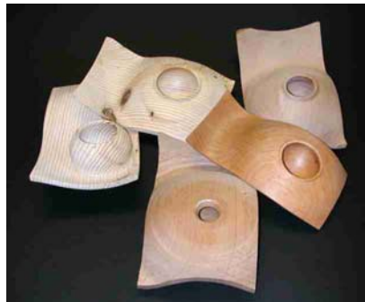
Bruce Perry – Winged vessels of various woods. "Some playful shapes for when treen just won't entertain."