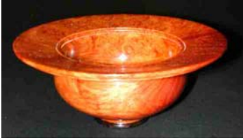
Wide-rimmed bowl of amboyna burl and ebony.