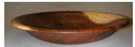
Rick Fleming – Bowl of walnut.