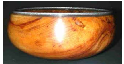
Paul Stafford – Bowl of ash with powdered aluminum metal rim.