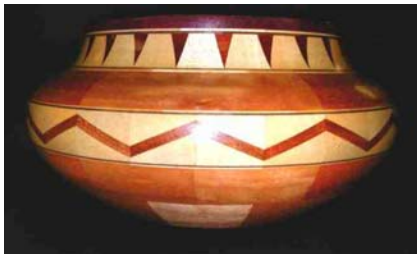
Andrew Chen – Segmented vessel of cherry, maple, and purpleheart.