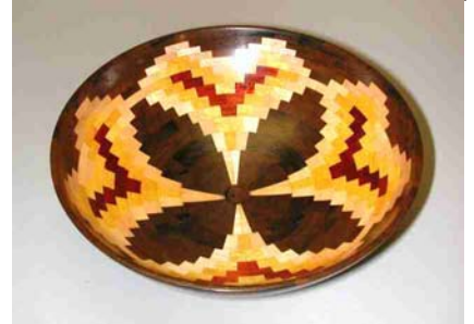
Andrew Chen - Two views of beautiful segmented bowl of maple, walnut, yellowheart, and Brazilian cherry.