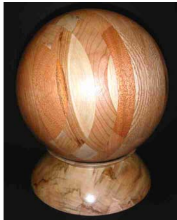
Steve Claycomb – Segmented ball on stand of oak, maple, cherry, and various woods.