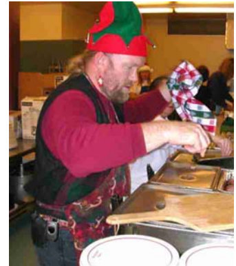
Bear making sure that the food is ready to go.