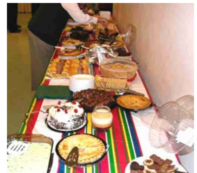
Only some of the wonderful desserts that members brought.