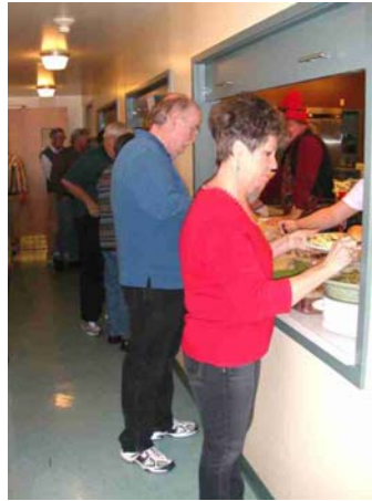
Getting the goodies.