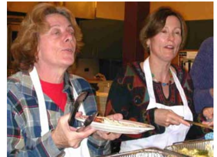
Hey! White meat or dark meat?!!!