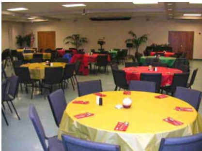
The silence before the party.

Well, it seemed that everyone had a great time. Lots of good food (LOTS of desserts, yeah!), a great auction, and fabulous people. Here are some pictures from the party.