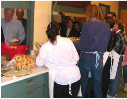
The identifying gang mark of the Apron-String Elves.