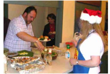
Helping ourselves to some of the wonderful dishes brought by members.