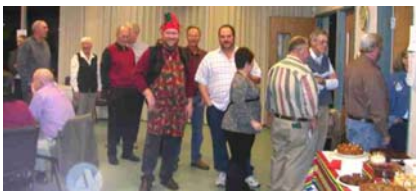
The line for the food. Notice how Bear is keeping the line moving?