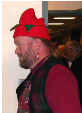
Must be the fresh air at the North Pole, but have you noticed how big