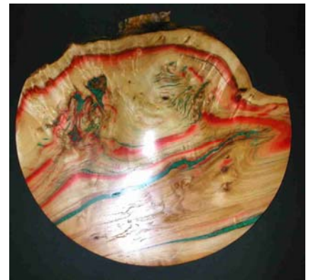
Terrence Rice – Wall hanging in box elder and inlaid turquoise. Stunning!