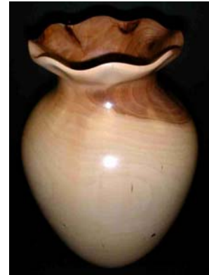
Phil Houck – Maple vase with carved rim.