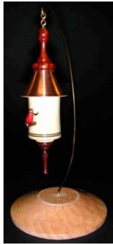
Pete Holtus – Spun copper, maple, and walnut birdhouse ornament.