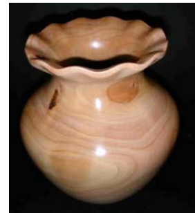
Phil Houck – Maple vase with carved rim.