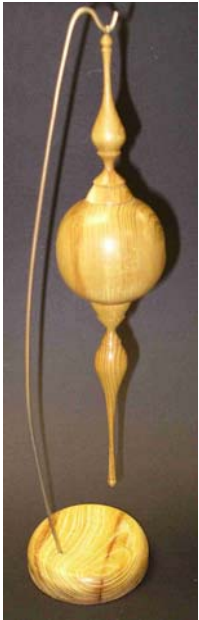
Terence Rice – Ornament and stand in osage orange.