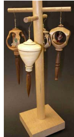
Les Hess – Ornaments with stand of aspen, oak, cherry, and glass.