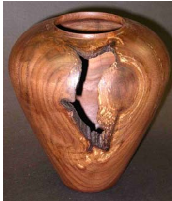
Jeff Barenberg – Hollow form in walnut with natural void. Oil finish.