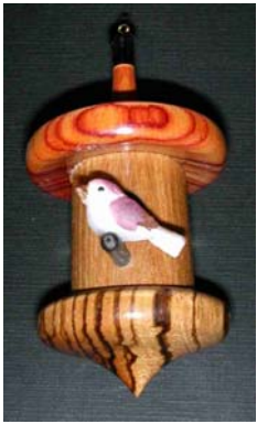
Ron Ainge – Tulipwood, maple, and bocote birdhouse ornament.