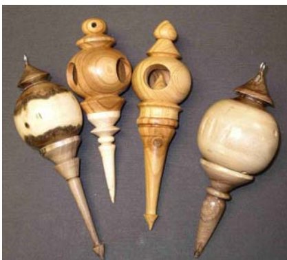
Steve Claycomb – Ornaments in apricot, walnut, and maple.