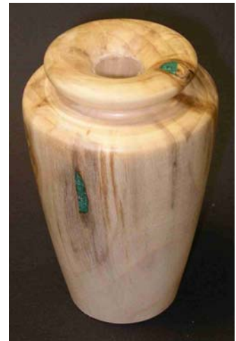
Greg Kline – Aspen vase with turquoise inlay. Shellwax finish.