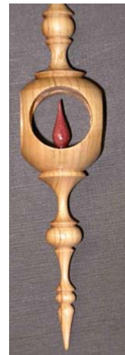
Grover Brown – Ornament of cherry and purpleheart.