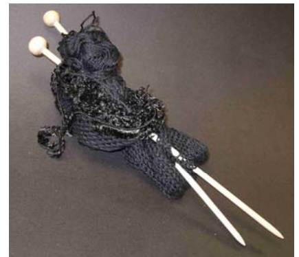
Bruce Perry – Knitting needles of maple.