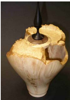
Grover Brown – Hollow form of box elder, ebony, and mesquite.