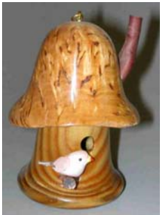
DLN – Russian olive and wormy maple birdhouse ornament.