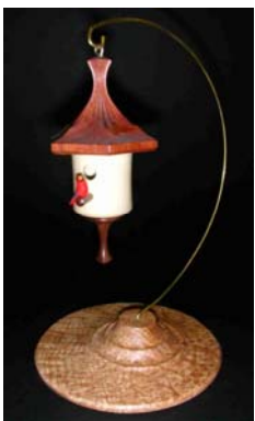
Gorst Duplessis – Maple and walnut birdhouse ornament with rose-engine detail on roof. From private collection of Pete Holtus.