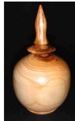
Steve Claycomb – Lidded box in apricot.