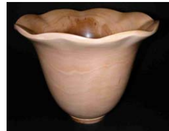
Phil Houck – Maple vase with carved rim.