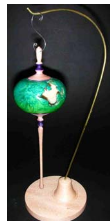
Don Derry – Dyed maple burl ornament with eccentric base. From private collection of Pete Holtus.