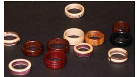
Roger Holmes – Girls' rings in various woods. Note the laminations.