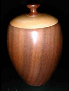
Rolla Lowery – Lidded box in maple and walnut.