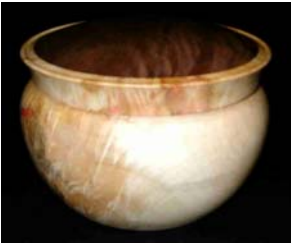
Rolla Lowery – Lidded box in maple and walnut.