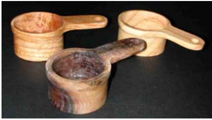
Steve Claycomb – Coffee scoops in walnut and oak.