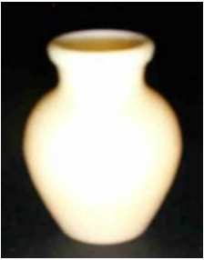
Rolla Lowery – Miniature vase of vegetable ivory.