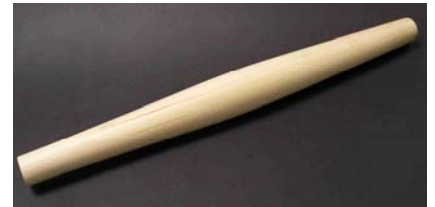
Bruce Perry – French rolling pin in maple. Mineral oil finish.