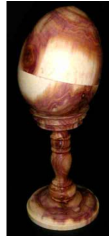
Rolla Lowery – “Egg” box on stand: cedar.