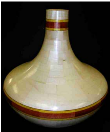
Jim Gennack – Segmented hollow form in maple, bloodwood, osage orange, ebony.