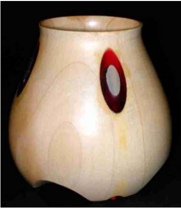
Gene Wentworth - Tea-light holder in maple, acrylic, and aluminum.