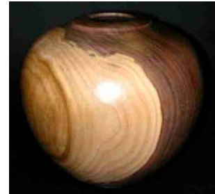
Grover Brown – Hollow form in walnut.