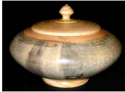
Rolla Lowery - Lidded bowl in beetle-kill pine.