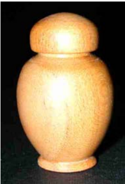
Rolla Lowery – Small box in nectarine.