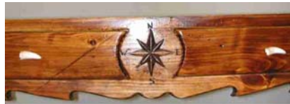
Closeup of carved detail on Bill's display stand. ❖