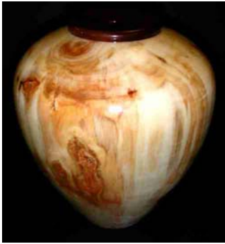
Ron Ainge – Hollow form in aspen, walnut.