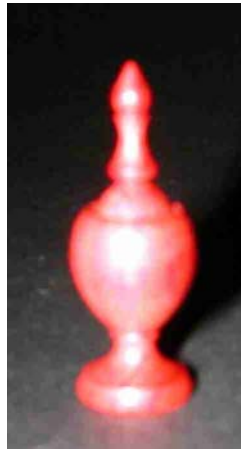
Steve DeJong - Miniature finial box in pink ivory.