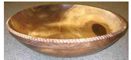
Gene Wentworth - Large carved-rim bowl in walnut.