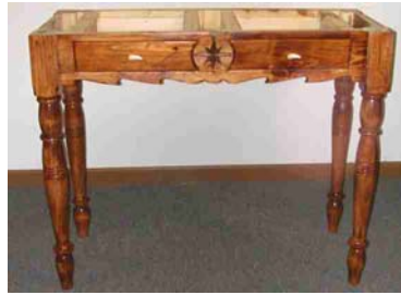
Bill Hoppers – Table base for ship display in Scandinavian plantation pine.