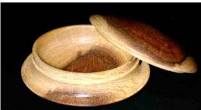
Rolla Lowery – Clam-shell box in mesquite.