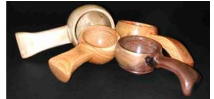
Steve Claycomb – S coops in honey locust, walnut, oak, maple.