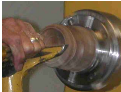
Starting to hollow box