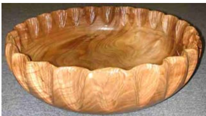
Gene Wentworth - Large carved-rim bowl in elm.