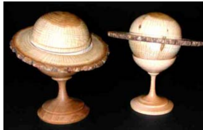
Pete Holtus – “Saturn” boxes in post oak, maple. One had a captured ring.