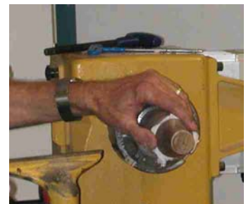
Reverse chucking to finish bottom. ❖