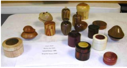
Samples of Chris's work.