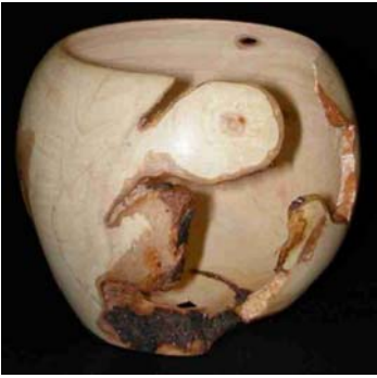
Jim Gennack - "More Air Than Wood" bowl of lilac.