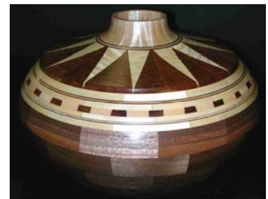
Jim Gennack - Segmented hollow form of walnut, maple, lacewood, beech, bloodwood.

There was no turning challenge for the July meeting. However, there were some excellent pieces brought by members to share in the Show and Tell.