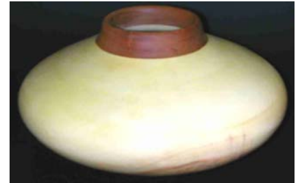
Bill Hopper – Hollow form in box elder and walnut. His first hollow form!❖