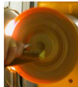
Using light to gauge the thinness of the brim.