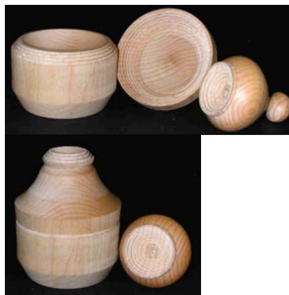
Box shown separated. ❖

membership. Keep in mind that they keep the register open late on meeting nights just for us. Just be sure to complete any purchases no later than the mid-meeting break so these poor guys can start shutting down and go home.