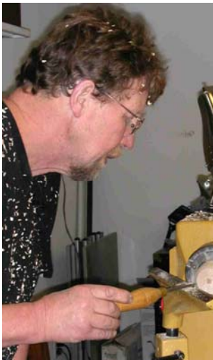
Chasing the angled threads. Use a very light touch.