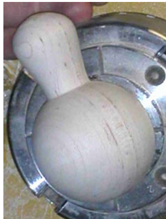
Scoop has been mounted sideways to hollow the scoop. Watch for the spinning handle!