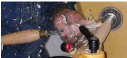
Demonstrating the skew chisel.