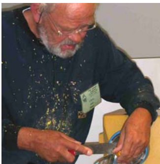
Parting off the box.