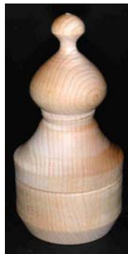
Angle-threaded 3-part box.