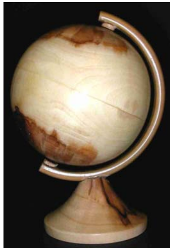
Steve Claycomb – Globe with stand of cottonwood.