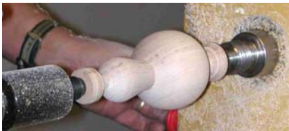
Turning one of his signature scoops. The scoop is shaped between centers. The scoop part must be perfectly spherical to ensure even hollowing when remounted.