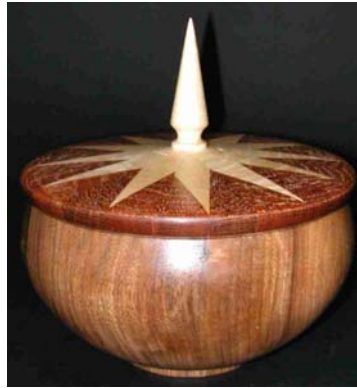
Jim Gennack – Segmented, lidded bowl: walnut, maple, lacewood w/carved insert. The lid was also a wooden top (the kind that spins).