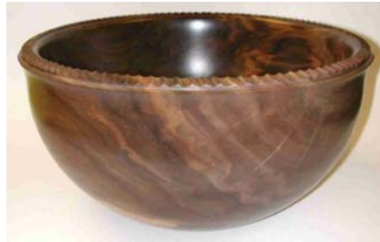
Gene Wentworth – Large bowl with carved rim in walnut.