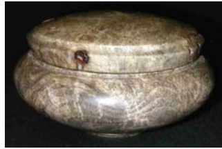
Pete Holtus – Lidded box of buckeye burl.