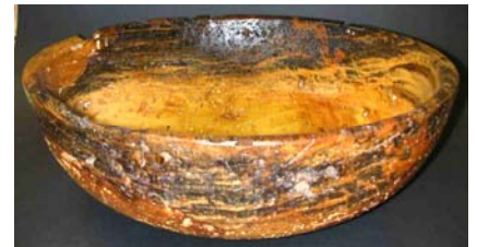
R. Lowery – Large bowl in spalted cottonwood.