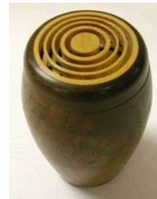
Less Hess – Spider box in maple and walnut.