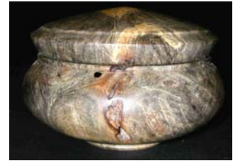
Pete Holtus – Lidded box of buckeye burl.