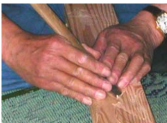
Closeup of his grip while carving.