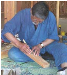
Showing how he carves details.