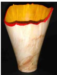
Gene Wentworth – Vase in dyed maple.