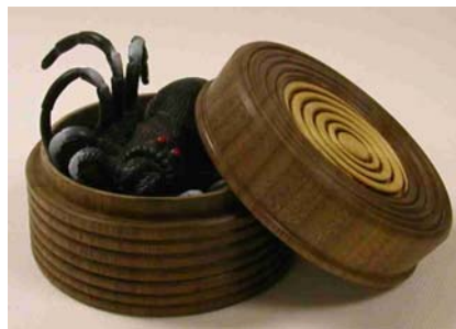
Bruce Perry – Spider box with spider, in walnut and maple.