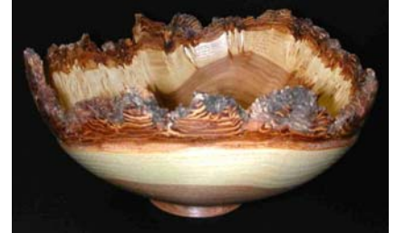
Pete Holtus – Natural-edged bowl of elm.