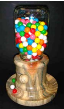
Ron Ainge – Gumball dispenser in beetle-killed pine. ❖