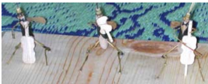
He makes cricket bands of twigs and wood scraps to sell to tourists.