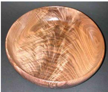
Jill Rice – Bowl of walnut flame burl.