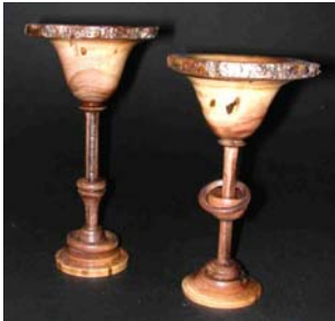
Steve Claycomb – Goblets with captured rings in walnut.