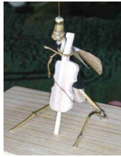
Closeup of his cricket musician.