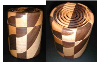
Less Hess – Two views of segmented spider box in maple and walnut.