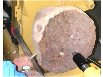
The rough blank is mounted between centers to allow for adjusting the axis. The top is mounted towards the headstock to keep from tearing it out.