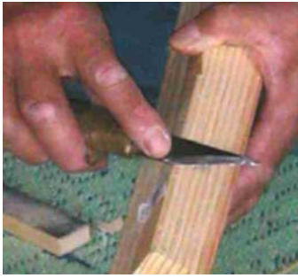
Traditional chisel showing the cutting angle. This is his "workhorse" tool.