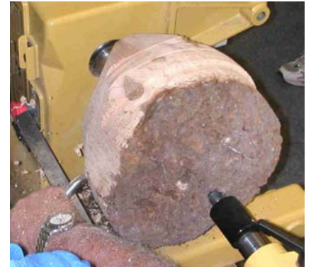
Rounding the outside.