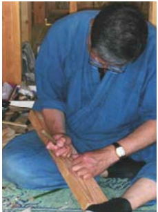
Showing his posture hold a carving piece. I hope I'm that limber at age 67.