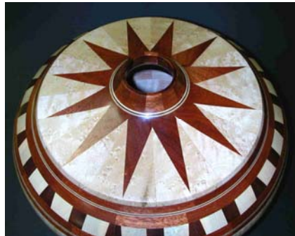
Jim Gennack – Segmented hollow form in maple and padauk.