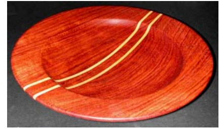
Jeff Barenburg - Bubinga/maple platter.