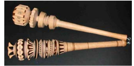
Two commercial molinaros, used to make hot chocolate in Mexico. ❖