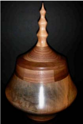
Terrence Rice - maple/walnut/brass lidded bowl.