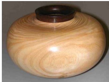
Ron Ainge - Hollow form, elm/mesquite.