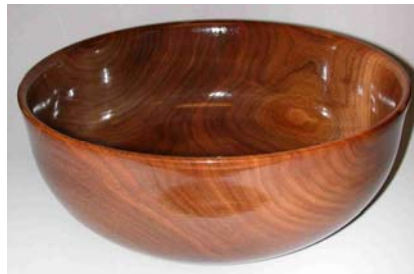
Dale "Woody" Hohman - Salad bowl, walnut.