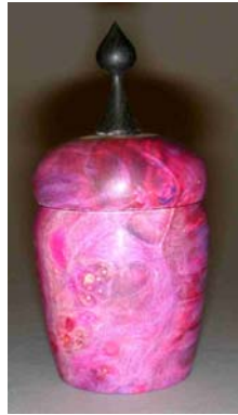
Les Stern - Finial box, dyed box elder/silver/ebony.