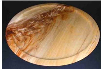
Bill Norberg - Platter, cottonwood.