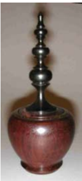
Grover Brown - Finial box, East Indian rosewood.