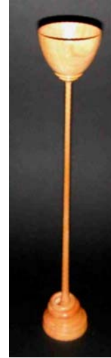
Grover Brown - Long-stem goblet w/captured rings, cherry.