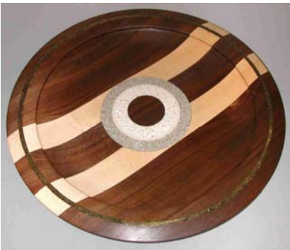
Grover Brown - Platter, walnut/maple/corian.