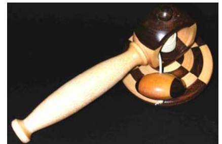
Les Hess - Maple/walnut top.