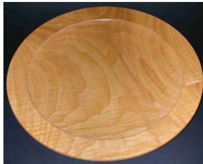
Dick Sing - Platter, ash.