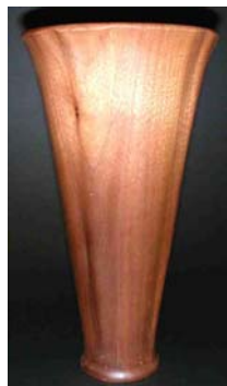
Barbara Craig – Walnut vase with carved sides.