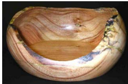
Terrence Rice – Honey locust natural-edge bowl.