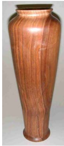
Barbara Craig – Walnut vase with carved sides.