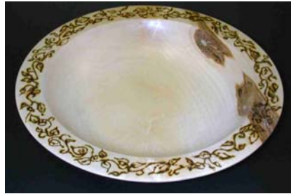
Ron Ainge – Box elder bowl with pyrographied rim.