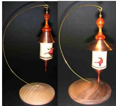
Pete Holtus – Birdhouse ornaments with spun copper roofs.