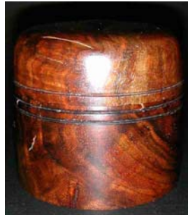
Bill Norberg – Walnut lidded box.