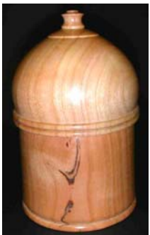
Grover Brown – Cherry lidded box.