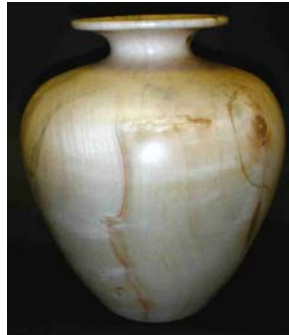
Grover Brown – Box elder hollow form.