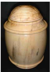
Bruce Perry – Box elder lidded box.