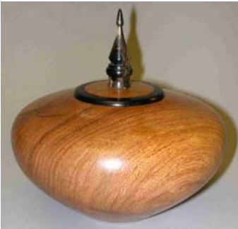
Grover Brown – Another beautiful walnut and ebony lidded hollow form.