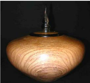
Grover Brown – Walnut and ebony lidded hollow form.