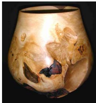
Jim Genack – Vase with bark inclusion.