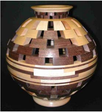
Harry Munson – Open segmented vase of maple and walnut.