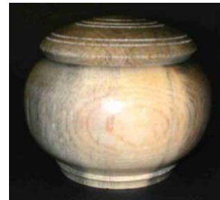
Ron Ainge – Blue pine lidded box.