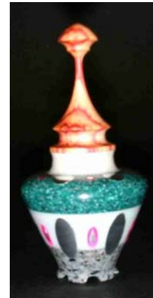
Gene Wentworth – Lidded box of Corian, tulipwood, aluminum, and pink acrylic.