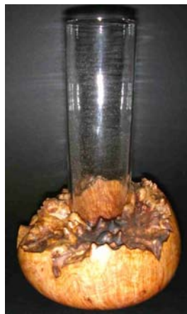
Cindy Drozda – Bud vase with burl base and glass insert. ❖