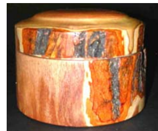
Kim Komitor – Honey locust lidded box with bark inclusions.