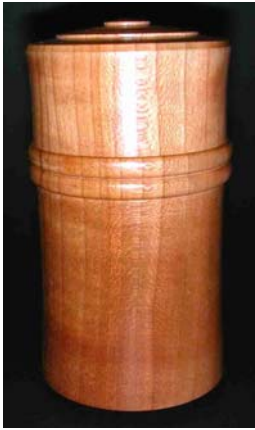
Bill Norberg – Cherry lidded box.