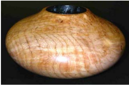
Cindy Drozda – Maple burl bud holder.