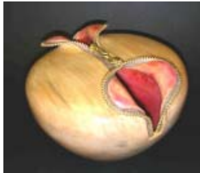
Hollow vessel turned in one piece and then inlaid with zippers (yes, real brass zippers).