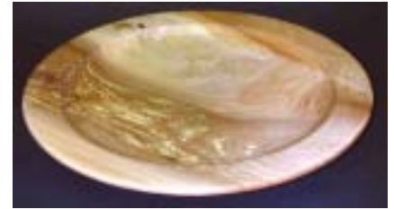
Large platter of spalted wood.