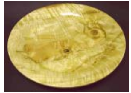
Beautiful cottonwood platter.