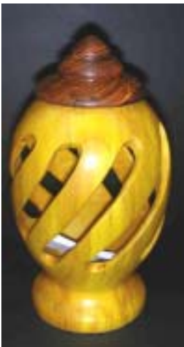
Spiral hollow form in osage orange and cocobolo.

Tom Wirsing demonstrated how to turn 2-axis table legs, also known as cabriolet legs.