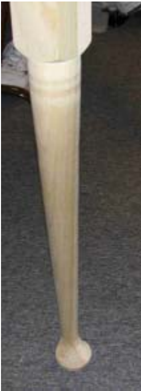
Finished leg. ❖

Using pattern-maker's rasp to blend ankle with foot and cone.