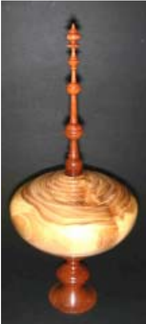
Lidded box with finial.