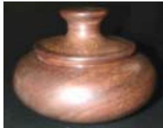
Small lidded box.