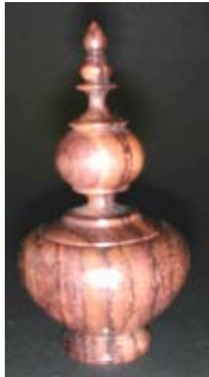
Small lidded box with finial.