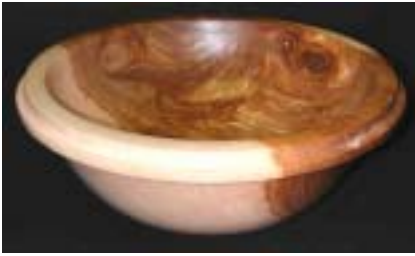
Bowl showing sapwood and heartwood.