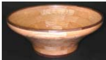
Segmented bowl in walnut and oak.