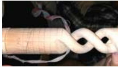
Sanding the spirals with strips of sanding cloth.