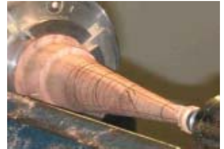
Showing the layout for his "pigtail" spiral. ❖