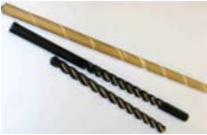
Dowels showing how he inserts different colored woods to show when spiral cut.