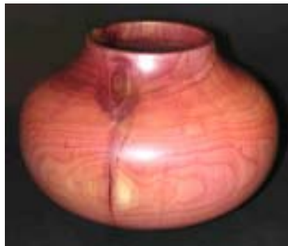
Grover Brown – Cedar hollow form.