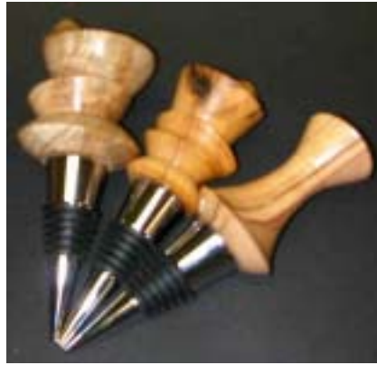
Bear Limvere – Bottlestoppers with eccentric African olive and burl handles. ❖