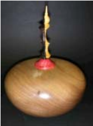
Bear Limvere – Myrtle hollow form with pink ivory and African blackwood eccentric finial.