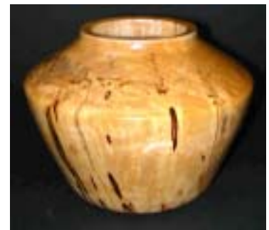
Jill Birch – Spalted birch hollow form.