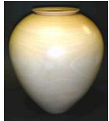
Grover Brown – Large sycamore hollow form.