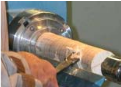
Using a gouge to start the spiral cut.