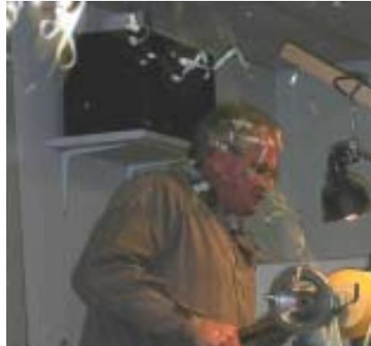
Making chips fly with his hollowing tool!