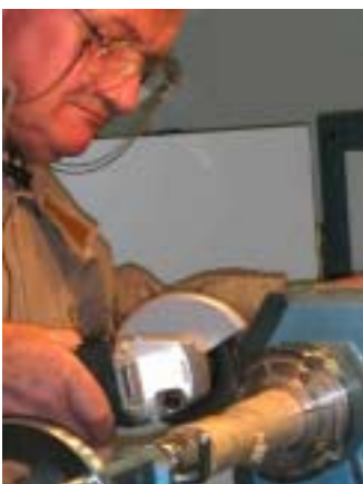
Using the Arbortech tool to cut the spirals deeper.