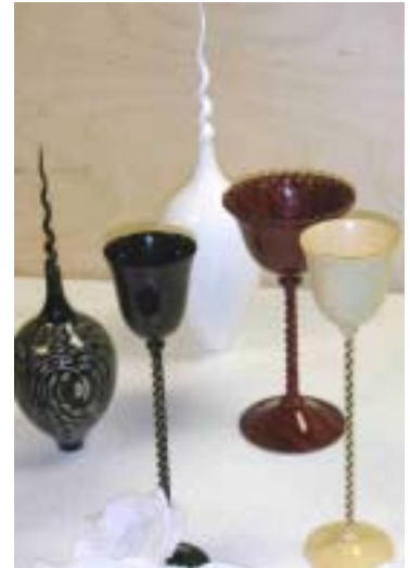
Exquisite samples of his work.