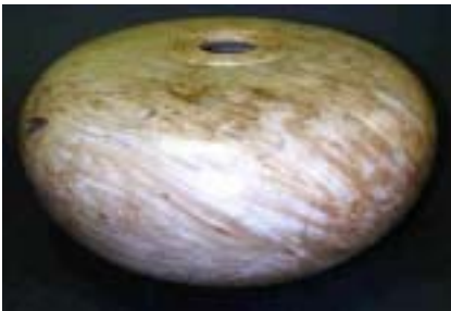
Bear Limvere – Big leaf maple hollow form.