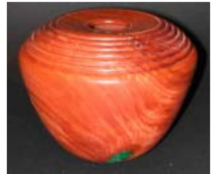
Bear Limvere – Australian desert burl hollow form with brass and malachite inlay.