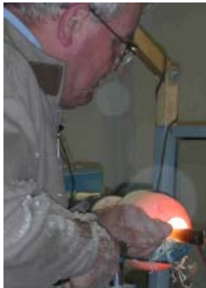
Turning with a light inserted in the hollow form that shines through the spiral cuts. (Yes, it was a glass bulb.)