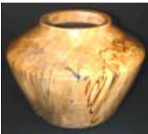
Jill Rice – Spalted birch hollow form.