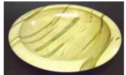
Brandon Mackie – Ambrosia maple platter with inlaid brass and copper.