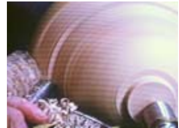
Using a gouge to shape the outside of the bowl after turning the chuck spigot.