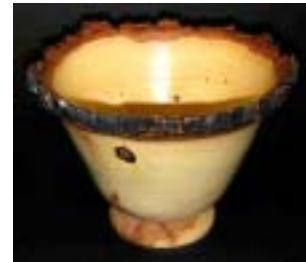
Jill Rice – Elm natural-edged end-grain bowl.