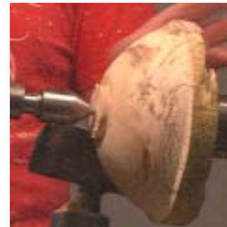
Sideview of the shape he is creating. Ron likes a nice, smooth curve from base to rim.