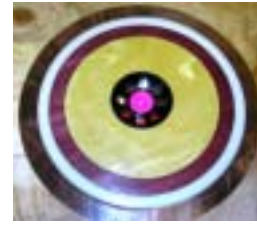
Gene Wentworth – Close-up of "pretty bottom" of laminated platter showing acrylic cabochon and aluminum rod inlay.