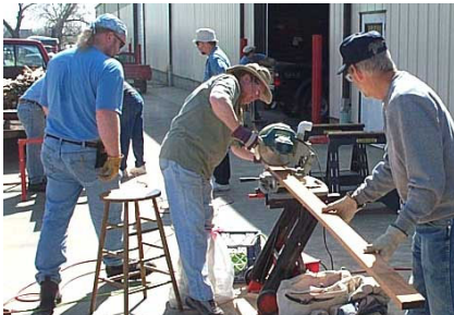
The Limvere cutting station.