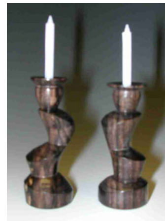
Bill Limvere – Close-up of miniature eccentric kingwood candlesticks. Actual size 1¼".