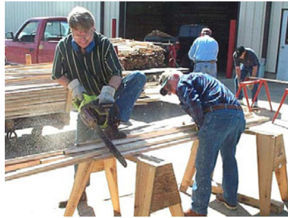
Kiddies, Don't try this at home!