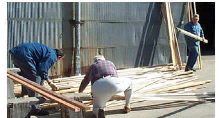
One of many piles of wood provided by Consolidated Hardwood.