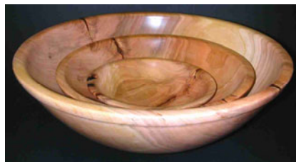
Grover Brown – Nested cherry bowls turned from single piece of wood.