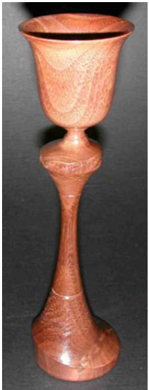
Steve DeJong – Eccentric walnut goblet with spiral detail.