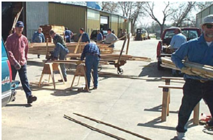
Carry and cut, carry and cut, until it's all gone.