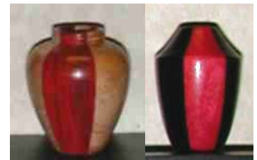
Bear Limvere – Miniatures made using Betts' fishing rod technique for the segmented glue-up. Redheart and maple. Pink ivory and ebony. Actual sizes 1 – 1 1/4". ❖