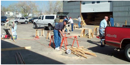
Overview of multiple cutting stations.