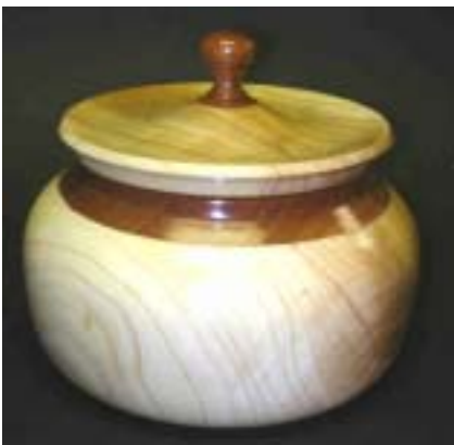
Ron Ainge – Large lidded box in maple and walnut.