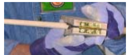
Sanding blocks in action. ❖