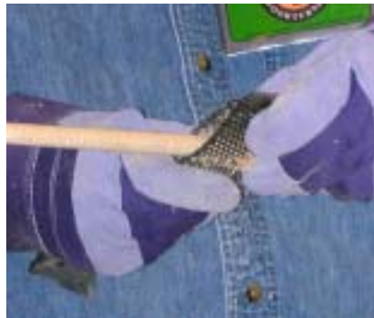
Closeup showing the Surforms in action.