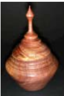
Ron Ainge – Walnut lidded box.