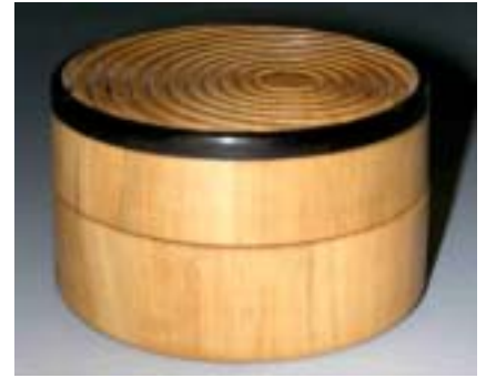
Pete Holtus – Boxwood and blackwood threaded lid box with lattice-work top.