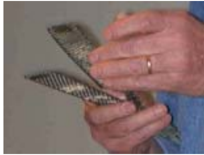
John's turning tools – two Surform blades taped at end to make a "sandwich."