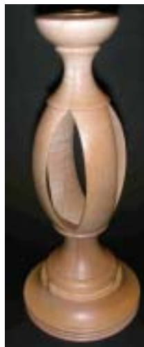
Pete Holtus – "Inside-out" turned candlestick in maple with brass insert.