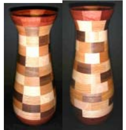
Jerry Smith – Segmented vases in walnut, cherry, ash, sycamore, bubinga using different patterns.