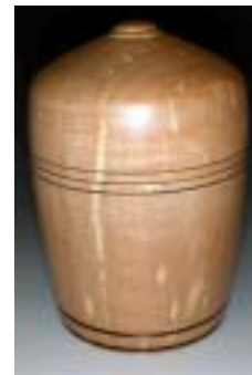
Kim Komitor – Maple lidded box with burned detail.