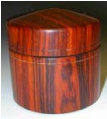
Pete Holtus – Cocobolo box with threaded lid.