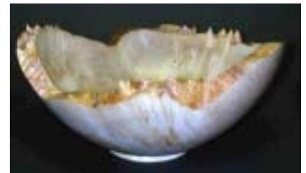
Grover Brown – Box elder natural-edged bowl.