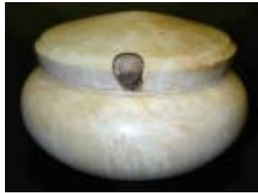
Pete Holtus – Box elder burl lidded box.