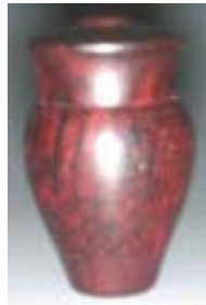
Steve DeJong – Bloodwood miniature threaded lid box (>1½" tall).