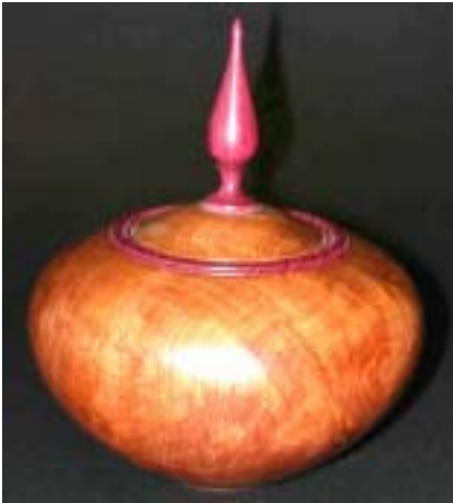
Grover Brown – Cedar and purpleheart lidded vessel.