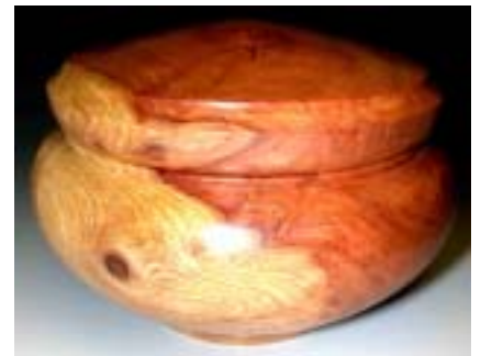
Pete Holtus – Redwood burl lidded box.