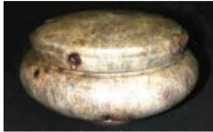
Pete Holtus – Buckeye burl lidded box.