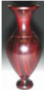
Steve DeJong – Kingwood miniature threaded lid box.