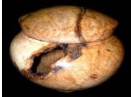
Pete Holtus – Maple burl lidded box.