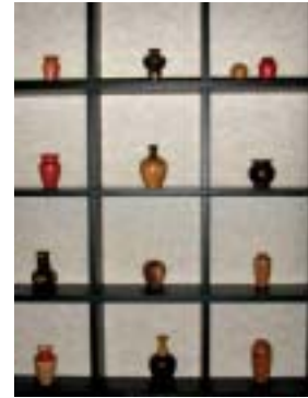
Bear Limvere – Miniatures in shadow box, various woods.