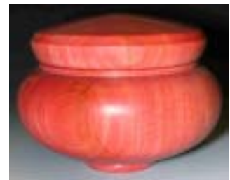
Pete Holtus – Pink ivory lidded box.