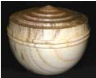
Grover Brown – Hackberry lidded box.