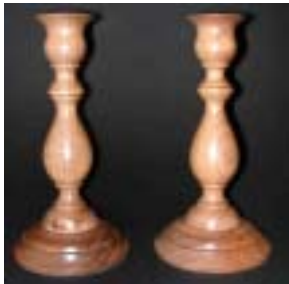
Steve DeJong – Maple and walnut full-sized candlesticks.