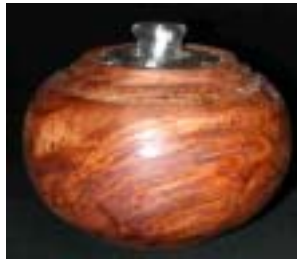
Megan Caine – Burl oil lamp with glass insert.