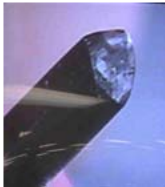
Close-up of the "multi-faceted" grind he uses on his gouges.