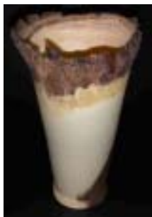
Grover Brown – Natural-edged walnut vase.