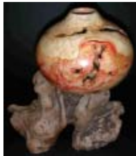
Brandon Mackie – Box elder hollow form with driftwood base.