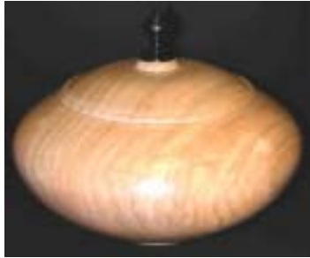
Jill Rice – Maple lidded vessel with ebony finial.