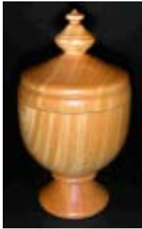
Megan Caine – Lidded vessel in satin wood.