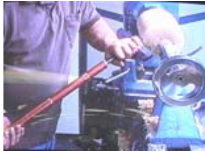
Side view showing his other grip used to help prevent repetitive motion strain.