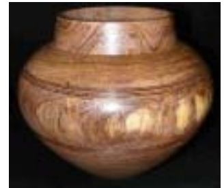
Grover Brown – Mesquite hollow form.