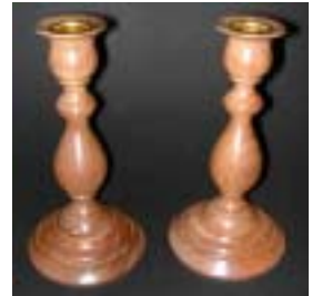
Phil Houck – Black walnut and brass candlesticks.