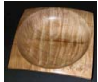
Jill Rice – Tiger maple square edged bowl.