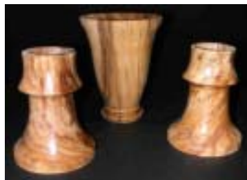
Allen Fulton – Birch candlesticks with match holder.