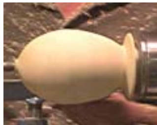
Final shape forming.