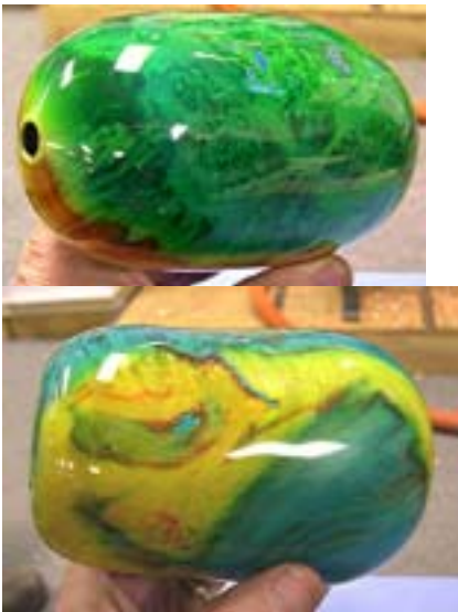
Samples of Don's work, showing some of the beautiful uses of color to enhance the grain of the wood. From his "River Rock" series, trying to copy the natural shapes of river-shaped rocks.