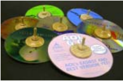
Pete Holtus – CD tops.