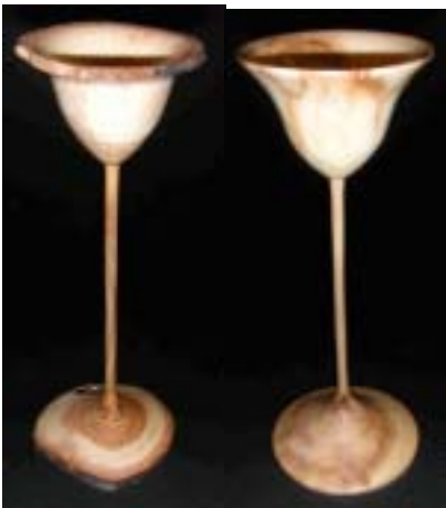
Steve Claycomb – Thin-walled goblets in cottonwood and oak.