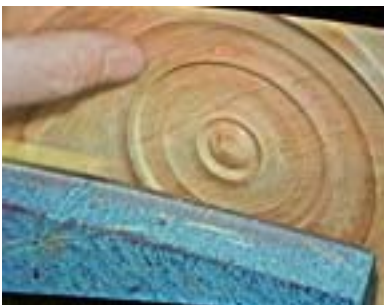
Inside of lid is being turned. Note very shallow recess that will be used to reverse-chuck the lid.