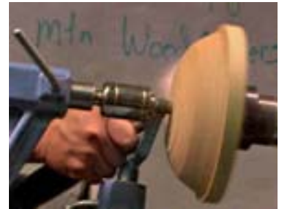
Shaping the bottom.