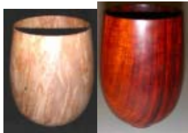
Keith Gotschall – Thin-walled vessels in cocobolo and burl.