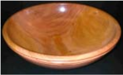
Grover Brown – Cherry bowl with beaded rim.