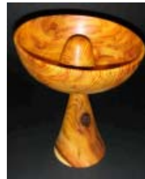
Terence Rice – Osage “Equilibrium” bowl and pedestal.