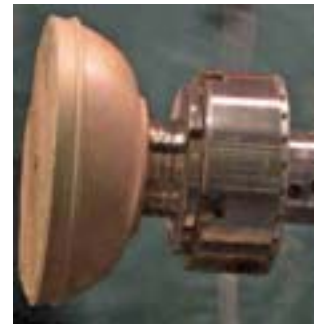
Bottom is reversed into chuck to hollow inside.