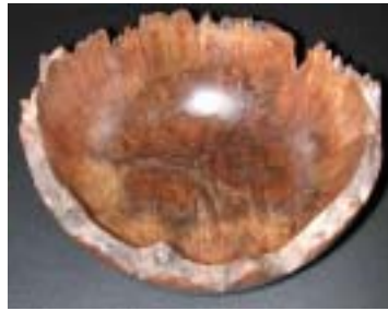
Pete Holtus – Claro walnut natural-edged bowl.