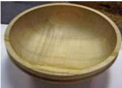
Finished inside of bottom bowl.