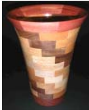
Jerry Smith – Segmented vase in walnut, cherry, maple, oak, and bubinga.