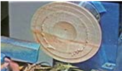
Lid is mounted and faced is being trued.