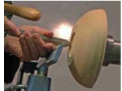
Turning recess in bottom for chuck.