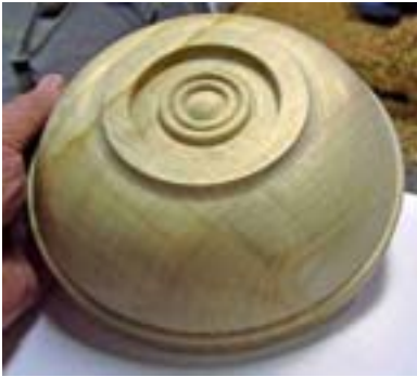
Finished outside of bottom bowl.