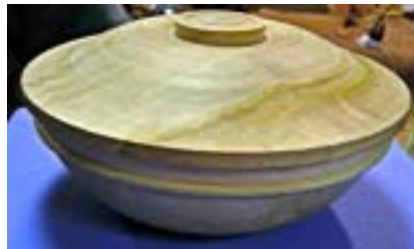
Finished lidded bowl. ❖