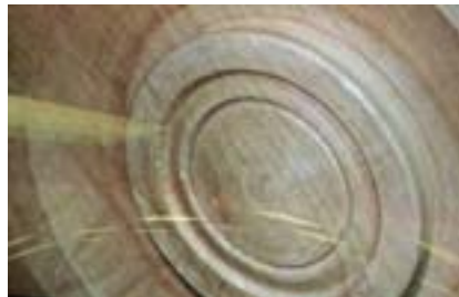
Close-up of lid handle.