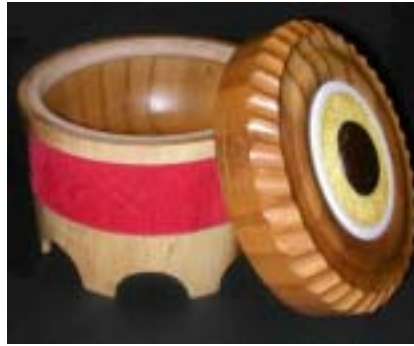
Gene Wentworth – Threaded lid box with carved detail and “pretty top.”