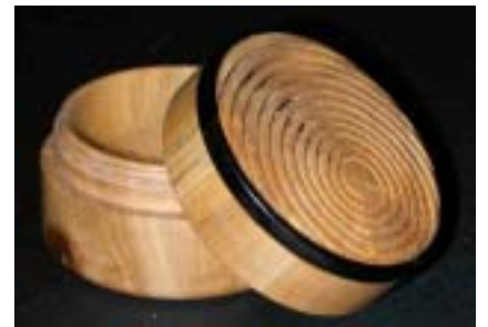
Pete Holtus – Threaded lid box of ebony and eccentric, latticed boxwood.