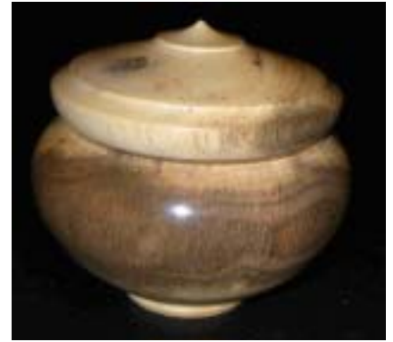
Pete Holtus – “Chinese hat” box with threaded lid.