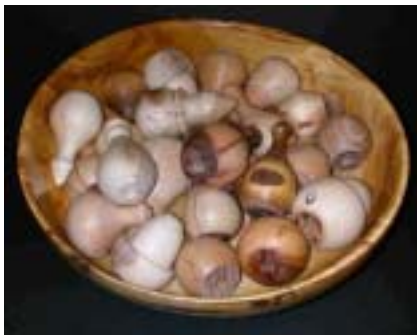
Steve Claycomb – Lots of lightpulls in various woods.