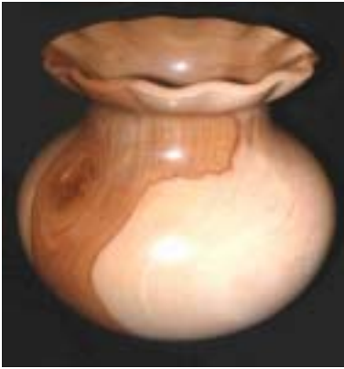
Phil Houck – Crabapple vase with carved “pie crust” rim.