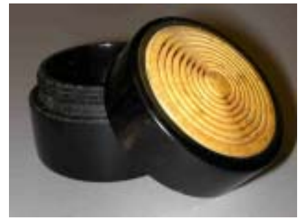
Pete Holtus – Threaded lid box of ebony and latticed boxwood.