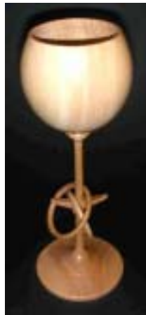
Phil Houck – Goblet with captured rings.