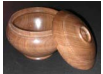
Pete Holtus – Threaded-lid box.