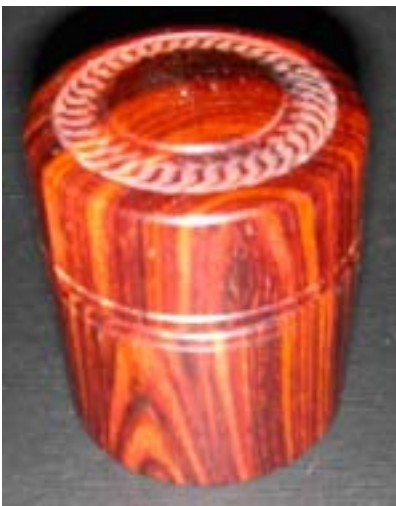
Grover Brown – Lidded box.