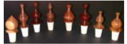
Pete Holtus – Bottlestoppers in various woods.