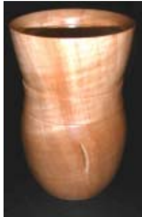
Jill Rice – Figured cherry vase. ❖