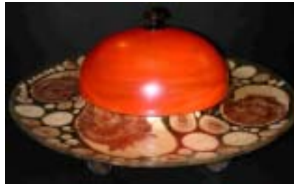
Gene Wentworth – Lidded platter of pine and epoxy resin.