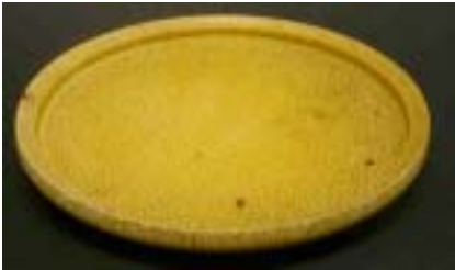
Jill Rice – Dyed Red Palm platter. Beautiful example of not being afraid of color.