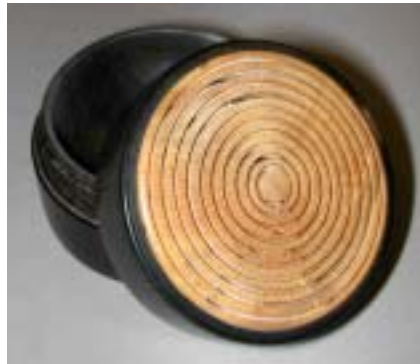
Pete Holtus – Threaded lid box of ebony and laticed bxwood.