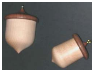
Ron Marchese – Maple and walnut acorn ornaments.