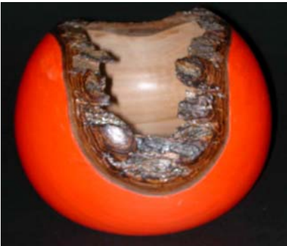
Gene Wentworth – Stained silver maple burl with bloodwood and rosewood pretty bottom.