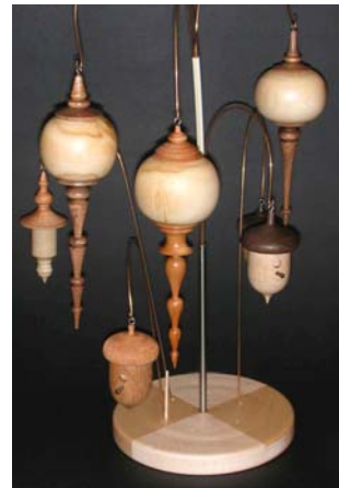
Grover Brown – Aspen and walnut ornaments; walnut and oak acorn birdhouse; maple and walnut acorn ornaments.