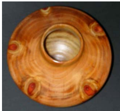
Jill Rice – Norfolk pine hollow form.