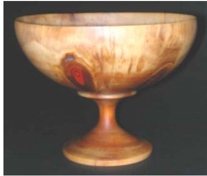
Pete Holtus – Norfolk pine stemmed dish.