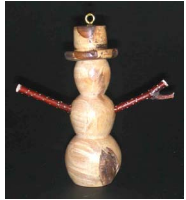
Ron Marchese – Maple snowman with twig arms (adorable!).