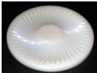
Bear Limvere – Ornamental turned disk in corian.