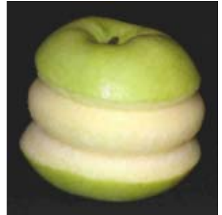
Lavonne Kaiser – Turned apple of “apple.”