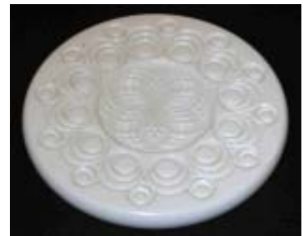
Bear Limvere – Ornamental turned disk in corian.