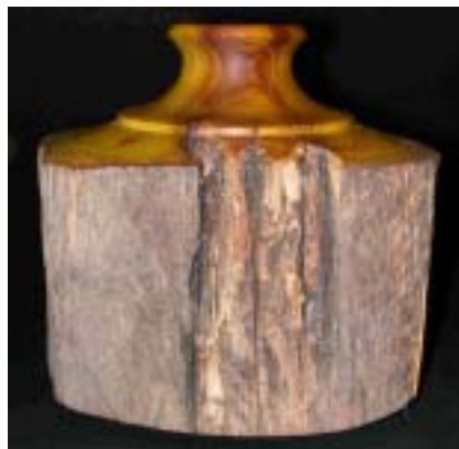
Pete Holtus – Osage orange weed pot with natural perimeter.