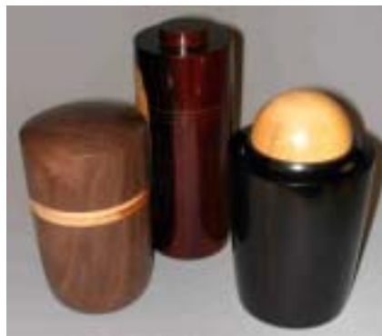
Various threaded boxes.