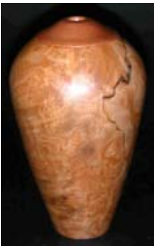
Ron Bentall – Maple burl vase with cherry rim.