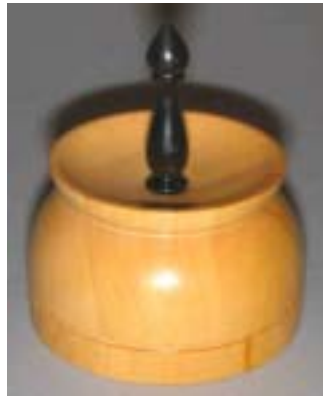
Threaded boxwood box with ebony finial. Trick – Finial is fixed to base and lid has hole that finial fits through.