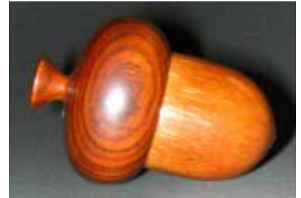
Threaded acorn box in cocobolo and palm nut.