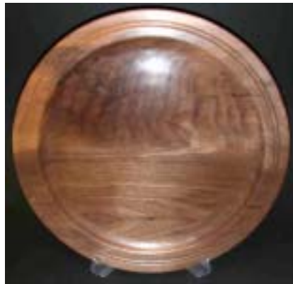
Ron Bentall – Walnut platter.