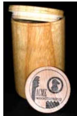
Threaded oak box with innovative “business cards.”