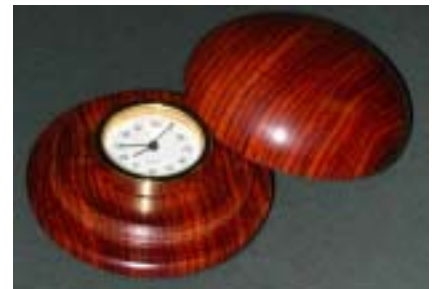
Threaded cocobolo pocket watch.