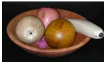
Grover Brown – Bowl of fruit with osage orange orange. (Get it?)