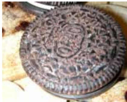
Close-up of the "Oreo" cookies. Glad they were glued down – I could have chipped a tooth!