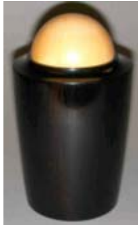
Cocobolo box with spherical threaded boxwood lid.