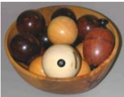
Bowl of threaded spheres in various materials.