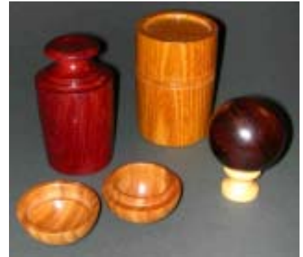
More threaded boxes and spheres.