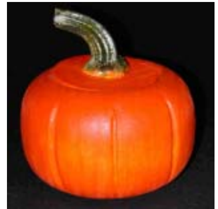
Megan Caine – Boxwood pumpkin box.