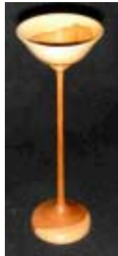
Pete Holtus – Mountain mahogany goblet.