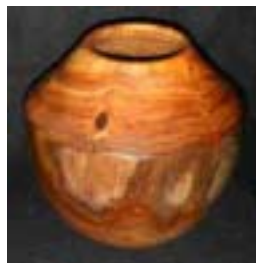
Jill Rice – Florida rosewood vase.