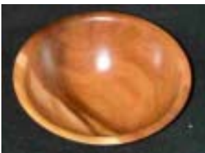
Ron Bentall – Figured apple bowl.