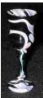
Gene Wentworth – Miniature goblet of pen-blank plastic.