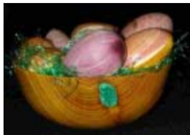
Terence Rice – Osage bowl with turquoise inlay with cedar, laminated cherry/osage/walnut, and box elder eggs. What an Easter basket!