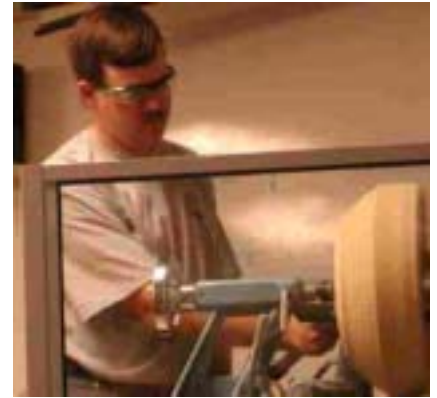
First, Allen uses the tail stock to support the blank mounted on a screw chuck, and rough turns the exterior shape.