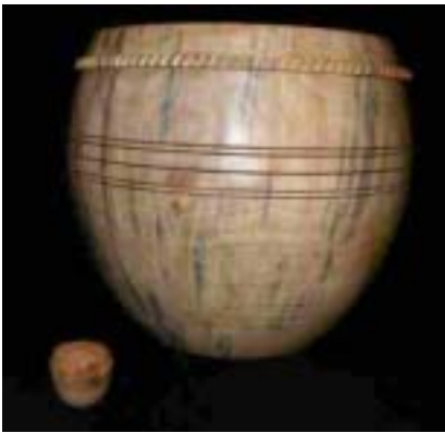
Gene Wentworth – “A chip off the old block.” Large bowl is pine with carved detail and ebony and silver pretty bottom. Small bowl is apricot with same carved detail and ebony and silver pretty bottom.