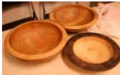
Bowls created by Allen using the McNaughton System.