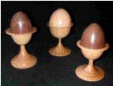
Steve DeJong – Hollow oak and walnut eggs in oak cups. Steve shows that you can turn even oak thin enough to shine light through.