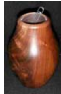
Jill Rice – Claro walnut paperclip holder.