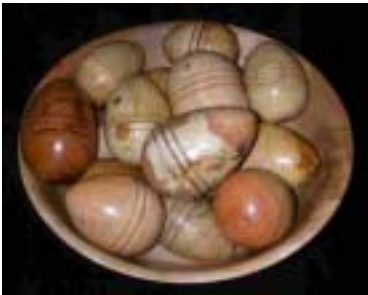
Steve Claycomb – Bowl of hollow eggs in plum, locust, pine, apple, cedar, birch, and maple.