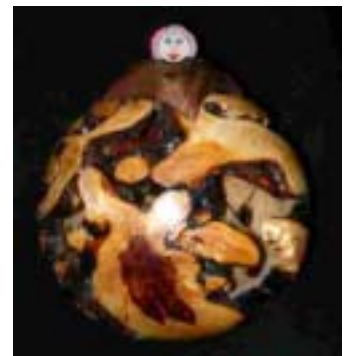
Gene Wentworth – Sphere bowl with “air-tight” walnut lid and clay detail.