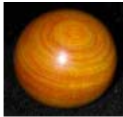
Beautiful osage orange sphere. (Editor did not get turner's name – apologies!)