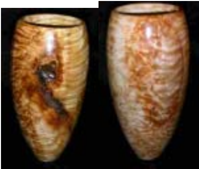
Lars Nyland – Two sides of his “firewood” vase. Goes to show that beauty can be found in the most unexpected places.