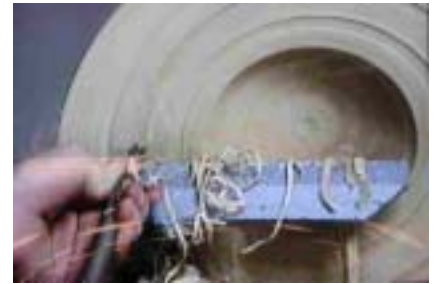
He then reverses the blank into a jawed chuck. He hollows the center to remove the hole from the screw chuck and uses the gouge to mark where each blank will be cored from the center.