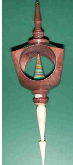
Close-up of Steve DeJong's ornament with turned internal tree.