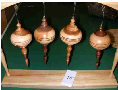
Phil Houck – Crabapple, maple, black cherry, and walnut ornaments on wooden stand.