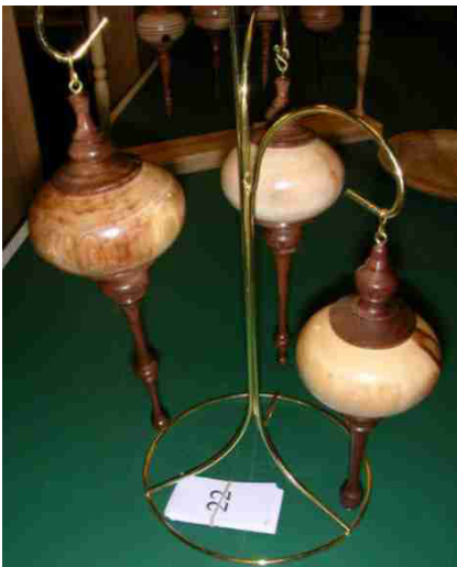
Pete Holtus – Aspen and walnut ornaments on wire stand.