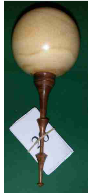
Woody - Aspen and walnut ornament.