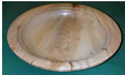
Ron Bentall – Silver maple crotch burl bowl.