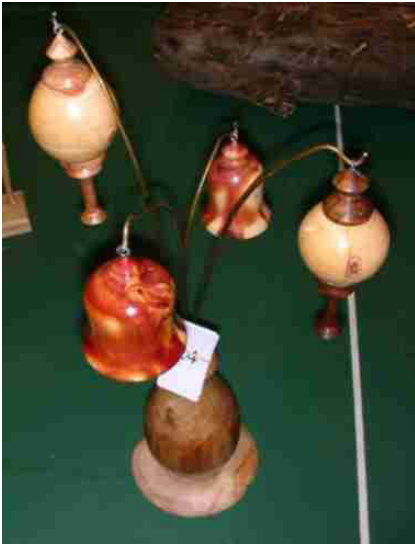
Steve Claycomb – Aspen and walnut ornaments, cedar bells on birch holder.