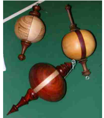
Bear and Alisa Limvere – Segmented ornaments in a variety of woods.

People brought the following items for the Show and Tell.