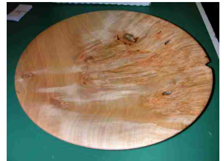
Pete Holtus – Maple burl platter.