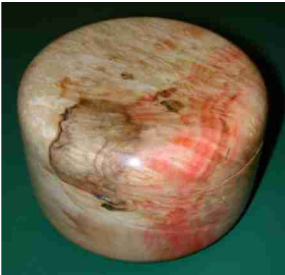
Brandon Mackie – Box elder burl lidded box.