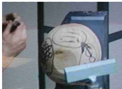
Marking out how the grain changes as a bowl-mounted blank spins.