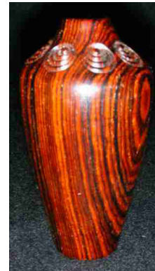
Bear Limvere – Miniature cocobolo vase with ornamental turning detail.