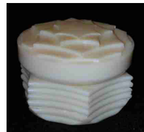
Bear Limvere – Miniature "French" ivory star box with ornamental turning detail.