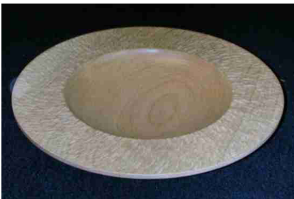
Pete Holtus – Cherry platter with textured rim.