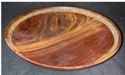
Paul Stafford – Walnut platter with carved rim. Winner of the October challenge!