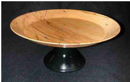
Barbara Craig – Spalted ash platter with ebonized pedestal.

People brought the following items for the Show and Tell.