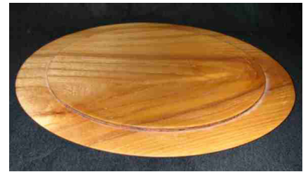
Bear Limvere – Elm "double" platter.