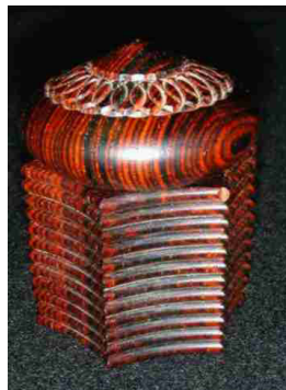
Bear Limvere – Miniature cocobolo "star" box with ornamental turning detail.