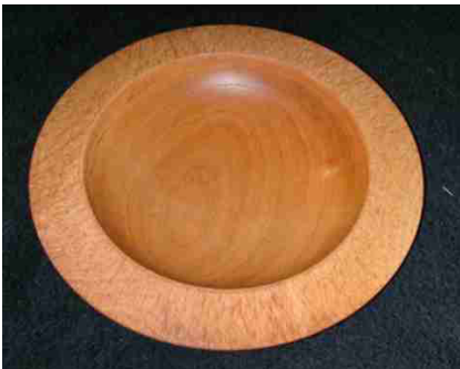
Pete Holtus – Cherry platter with textured rim.