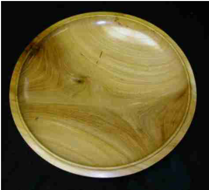
Phil Houck – Elm platter.