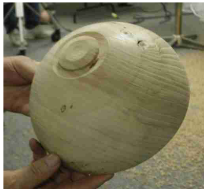
The finish on an elm bowl using the push method of turning.