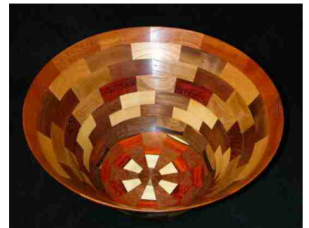
Joe Blanc – Segmented bowl in mult. woods.