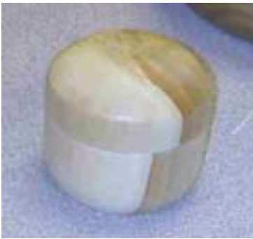
HT – Aspen box.