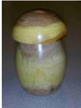
August H. – Mesquite and cocobolo threaded mushroom box.