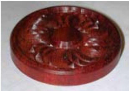
Bear Limvere – Engraved bloodwood inlay.