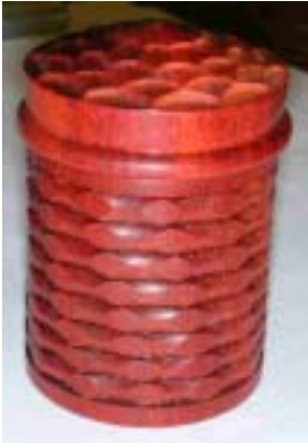
Bear Limvere – Engraved bloodwood box.