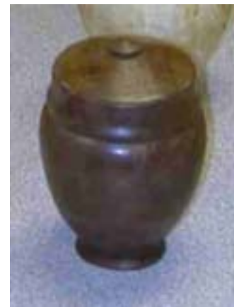
Ron Bentall – Walnut box.

In addition, the following members brought pieces: