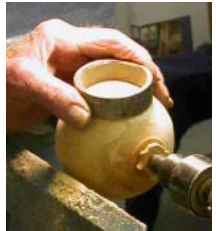
Using a ring cut from a pipe to test roundness.