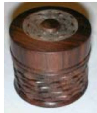
Bear Limvere – Engraved mfigure box.