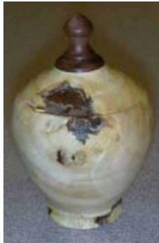
Ron Bentall – Box elder burl and walnut box.