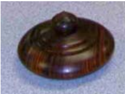
August H. – Threaded cocobolo box.