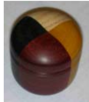
Bear Limvere – 4-Winds box, ebony, ash, osage, and bloodwood.