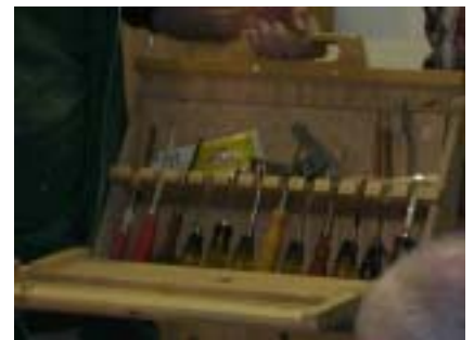
Carrying case for his tools. ❖