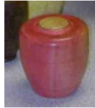
Jill Rice – Pink ivory and sycamore box.