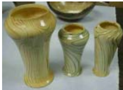
Bonnie Craig – Carved ash vases with grain enhanced by bronze powder or green dye.