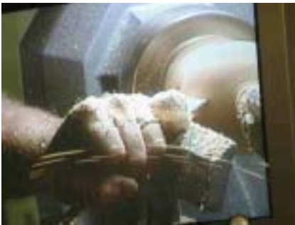
Shaping the outside. ❖