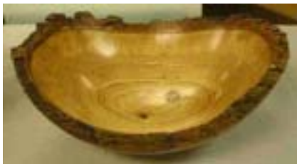
Phil Houck – Natural-edged bowl in post oak (excellent example of how “waste” wood can become a beautiful turned object).