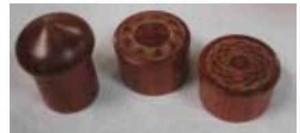
Bear Limvere – Lidded boxes of bloodwood and two with engraved lids.

In addition, members brought the following beautiful pieces: