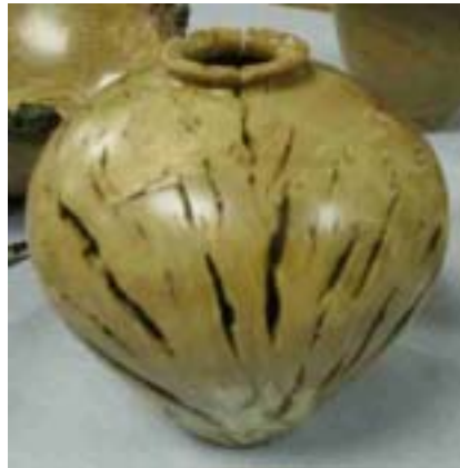
Grove – Vase of “mystery” burl won at an FRW meeting.