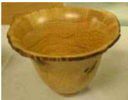
Phil Houck – Natural-edged bowl in post oak.