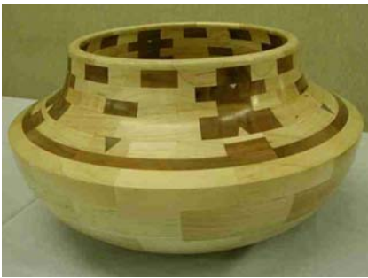
Bruce Knuth – Maple and walnut segmented bowl.