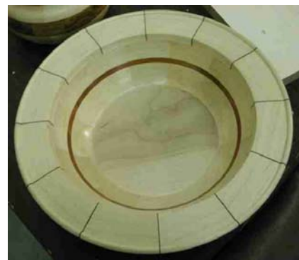
Bruce Knuth – Maple and walnut segmented bowl (this and the following bowls are samples of his segmenting technique).