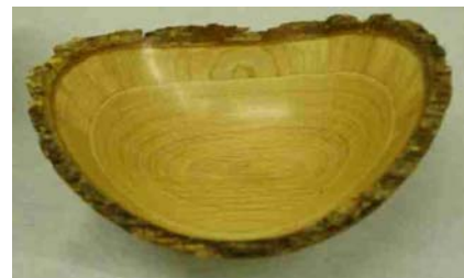
Phil Houck – Post oak bowl with natural edge.