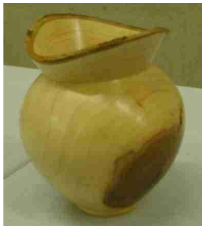
Phil Houck – Apple vase with natural edge.

There were a large number of pieces brought to our Show and Tell in October.