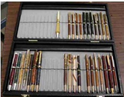
Pete Kuly – Pens made with miscellaneous materials.