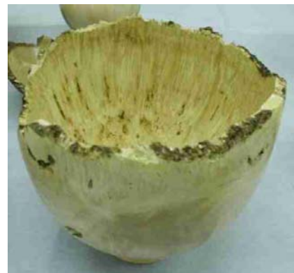
Phil Houck – Box elder burl vase with natural edge.