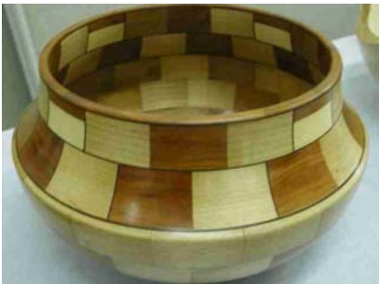
Bruce Knuth – Segmented bowl, mixed woods.