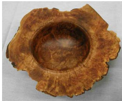
Jill Rice – Maple burl bowl with natural edge.

In addition, the following people brought items: