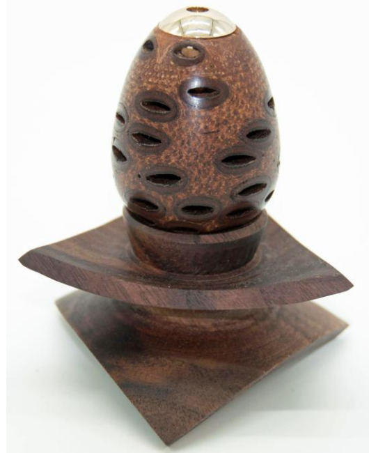
Jeff Spahr – Walnut, Banksia Pod