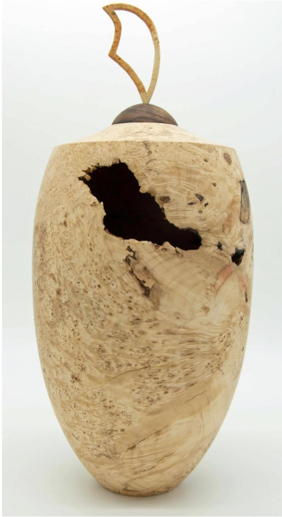
Roper – Box Elder Burl