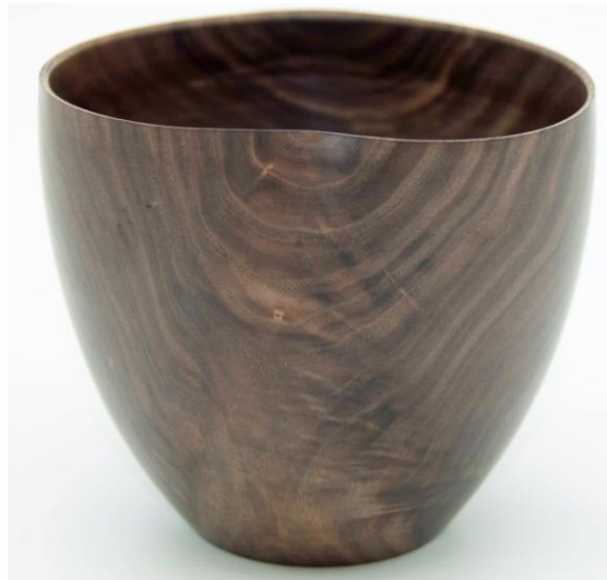
Dale Quakenbush - Walnut