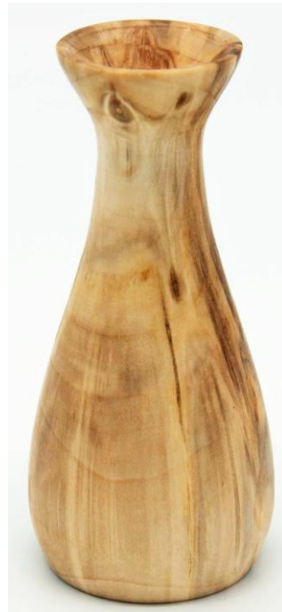
Rick Cantwell - Aspen