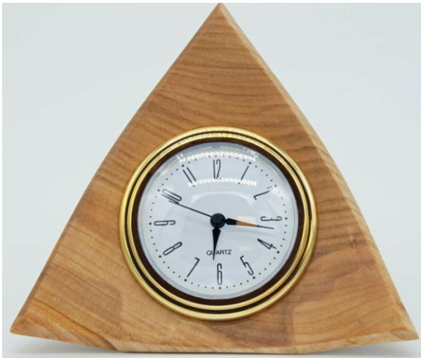
Ron Kaemingk - Birch