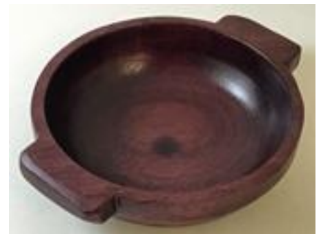
Tim Capraro - Purpleheart