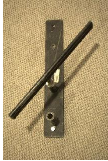
Plate at bottom is 26" long. Either of two post supports may be moved to any of 5 holes that are 5" apart.