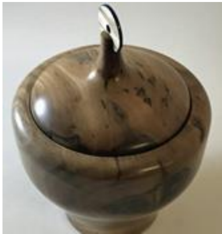
Ed Lippert - Ash