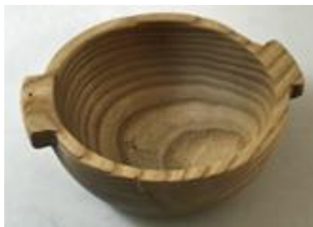
Tim Capraro – Silver Maple