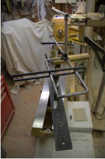
Shown on my Powermatic 3520B lathe with 18" bed extension