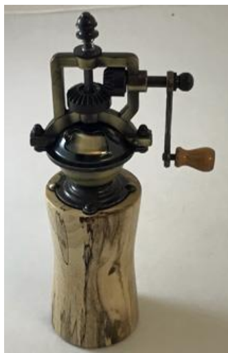
Carl Maccarrone – Spalted Hackberry