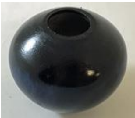
Tim Capraro - Maple