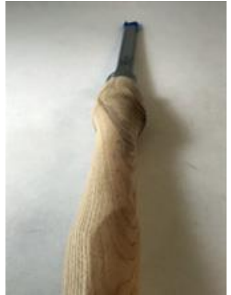
Larry Abrams - Ash