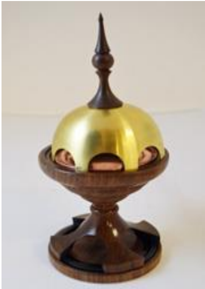
Grove Brown – Walnut, Copper