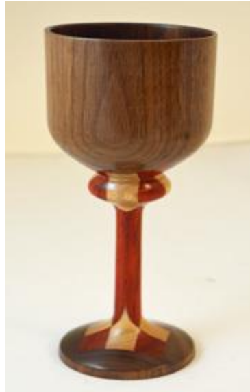
George Tavacs –Walnut, Maple, Paduk