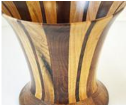
Ed Lippert – Walnut, Butternut