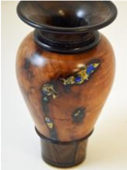
Pat Hannon - Ziracote, African Blackwood, Madrone burl, Brass & Chrysacola stone