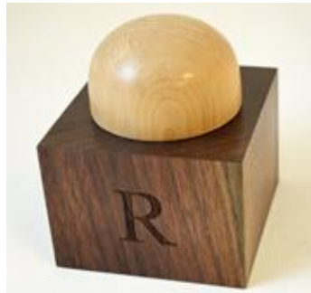
Doug Stearns – Black Walnut, Spalted Maple, Juniper (inside)