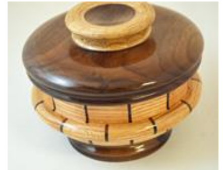
Darrell Talbott – Oak, Walnut