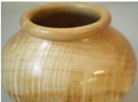
Roger Holmes - Cottonwood