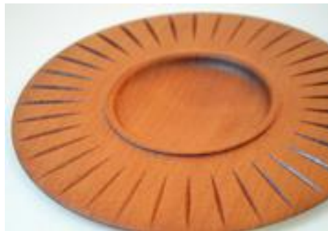
Dave Hawley – Old Growth Redwood