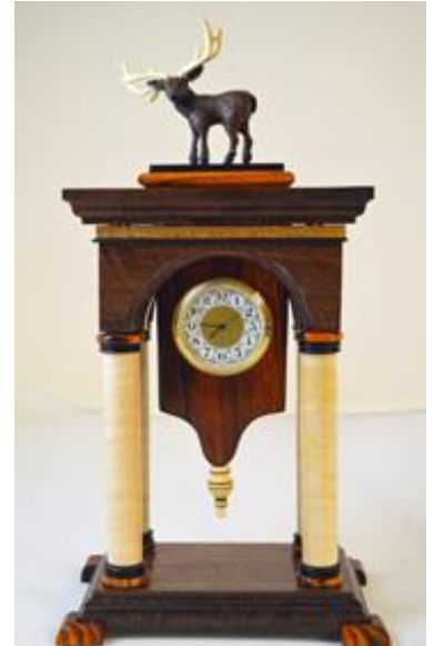
Pat Hannon – Walnut, Holly, Maple,African Blackwood