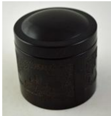
Doug Stearns – African Blackwood & Curly Maple