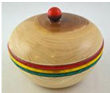
Grove Brown - Ash