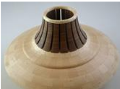
Larry Long – Maple, Walnut