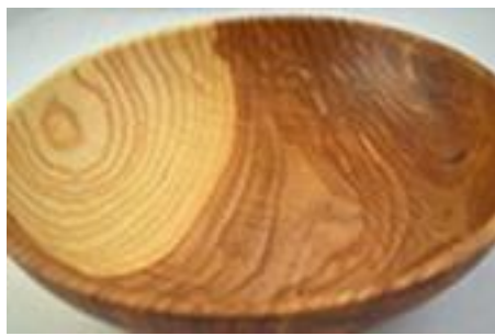
Scott Highland – Ash