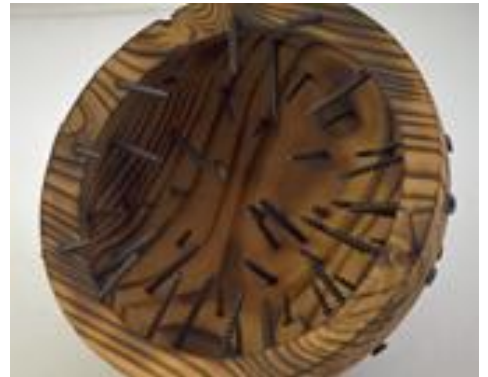
Roper – Russian Olive