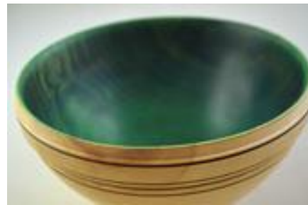
Don Rogers - Maple