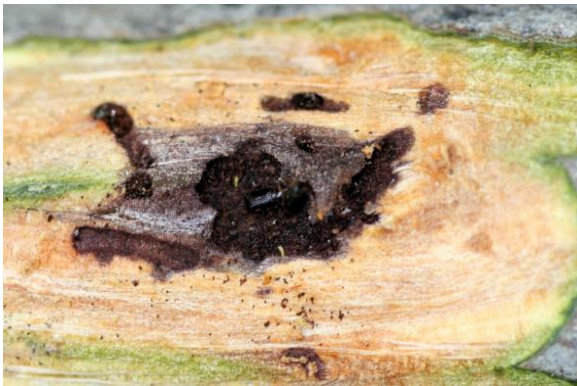
Figure 6. Walnut twig beetle and associated staining around tunnel.

Winter is spent primarily, and possibly exclusively, in the adult stage sheltered within cavities excavated in the bark of the trunk. Adults resume activity by late-April and most fly to branches to mate and initiate new tunnels for egg galleries; some may remain in the trunk and expand overwintering tunnels. During tunneling the Geosmithia fungus is introduced and subsequently grows in advance of the bark beetle (Figure 6). Larvae feed for 4-6 weeks under the bark in meandering tunnels that run perpendicular to the egg gallery (Figure 7) and pupate at the end of the tunnel.