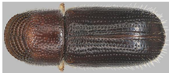
Figure 5. Walnut twig beetle, top view.