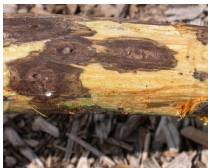
Figure 2. Coalescing branch cankers produced by Geosmithia . Note the whitish sporulation of Geosmithia in lower left gallery.