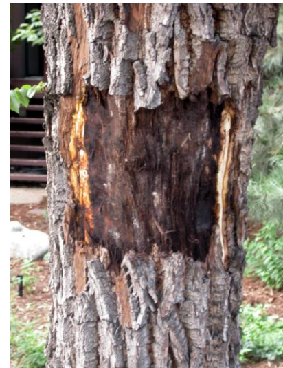
Figure 9. Large trunk cankers of black walnut associated with Fusarium solani .

A second canker type may occur on black walnut trees in advanced stages of decline. These diffuse cankers are much larger than branch cankers caused by Geosmithia and often exceed two meters in length, extend from the ground into the scaffold branches, and may encompass more than half the circumference of the trunk (Figure 9). Trunk cankers are not readily visible without removal of the outer bark. However, a dark brown to black stain on the bark surface or in bark cracks often indicates the presence of a canker. The inner bark and cambium below the bark surface on the canker face is macerated, water-soaked and stained dark brown to black. Both the walnut twig beetle and Geosmithia are found in the macerated bark but a second fungus Fusarium solani also has been consistently isolated from canker margins. The importance of Fusarium solani in the development of these trunk cankers is still being determined.