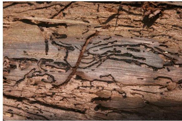
Figure 7. Walnut twig beetle tunneling under bark of large branch.

Adults emerge to produce a second generation. Peak flight activity of adults occurs from mid-July through late August and declines by early fall as the beetles enter hibernation sites. A small number of beetles produced from eggs laid late in the season may not complete development until November.