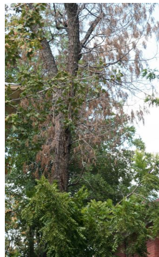
Figure 1. Rapidly wilting black walnut in the final stage of thousand cankers disease.

Within the past decade an unusual decline of black walnut ( Juglans nigra ) has been observed in several western states. Initial symptoms involve a yellowing and thinning of the upper crown, which progresses to include death of progressively larger branches (Figure 1). During the final stages large areas of foliage may rapidly wilt. Trees often are killed within three years after initial symptoms are noted. Tree mortality is the result of attack by the walnut twig beetle ( Pityophthorus juglandis ) and subsequent canker development around beetle galleries caused by a fungal associate ( Geosmithia sp.) of the beetle (Figure 2). A second fungus ( Fusarium solani ) is also associated with canker formation on the trunk and scaffold branches. The proposed name for this insect-disease complex is thousand cankers .