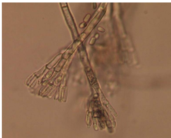
Figure 8. Conidiophores and conidia of Geosmithia .

Two different types of cankers have been observed on declining walnut trees. Small, diffuse, dark brown to black cankers, caused by an unnamed fungus in the genus Geosmithia , initially develop around the tunnels of the walnut twig beetle (Figure 8). The fungus has also been cultured from beetles that emerge from black walnut.