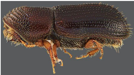
Figure 4. Walnut twig beetle, side view.

Description. The walnut twig beetle Pityophthorus juglandis is a minute (1.5-1.9 mm) yellowish-brown bark beetle, about 3X long as it is wide. It is the only Pityophthorus species associated with Juglans but can be readily distinguished from other members of the genus by several physical features (Figures 4, 5). Among these are 4 to 6 concentric rows of asperities on the prothorax, usually broken and overlapping at the median line. The declivity at the end of the wing covers is steep, very shallowly bisulcate, and at the apex it is generally flattened with small granules.